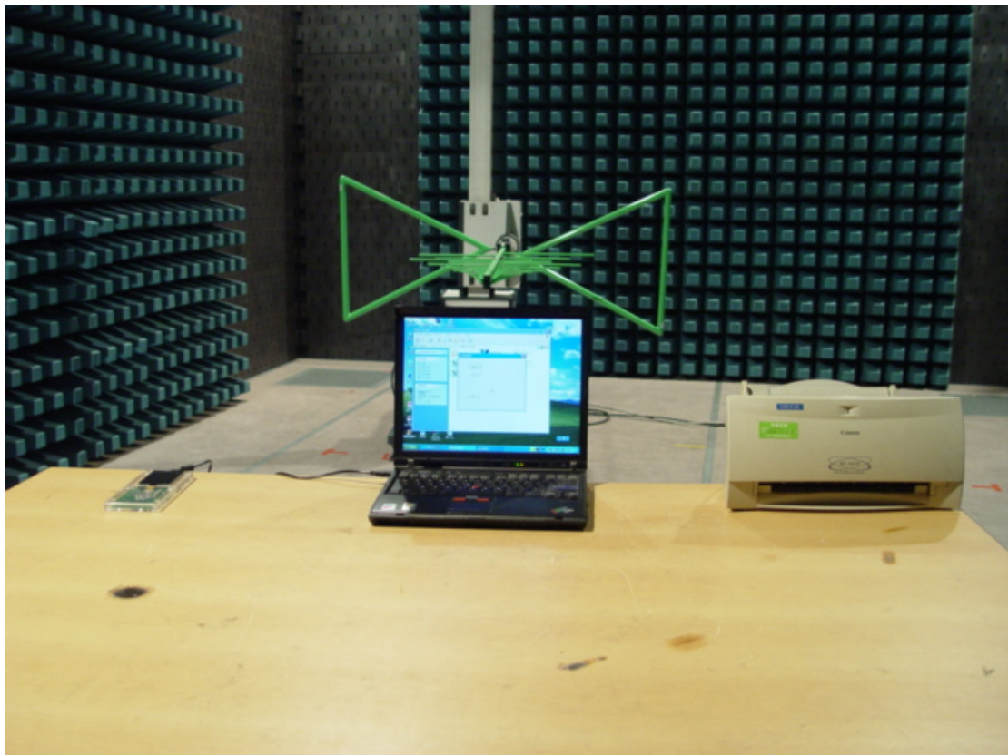
Photo 4 Radiated Emission