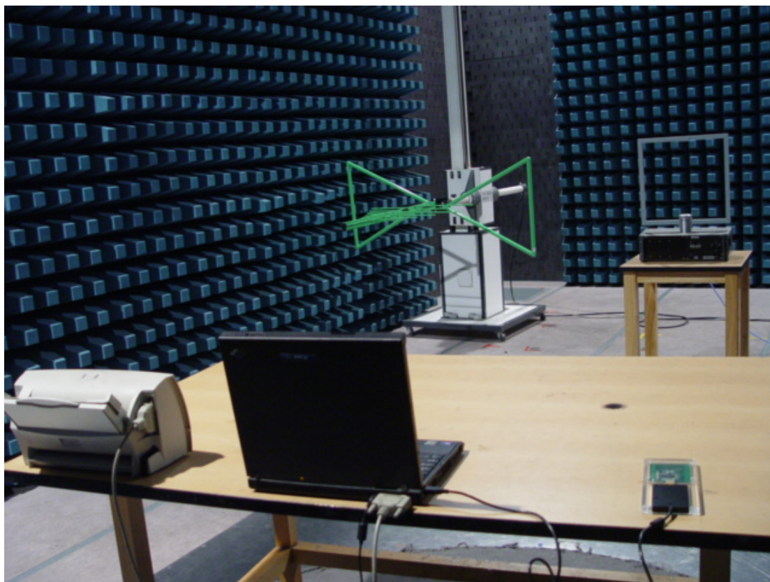
Photo 6 Radiated Emission