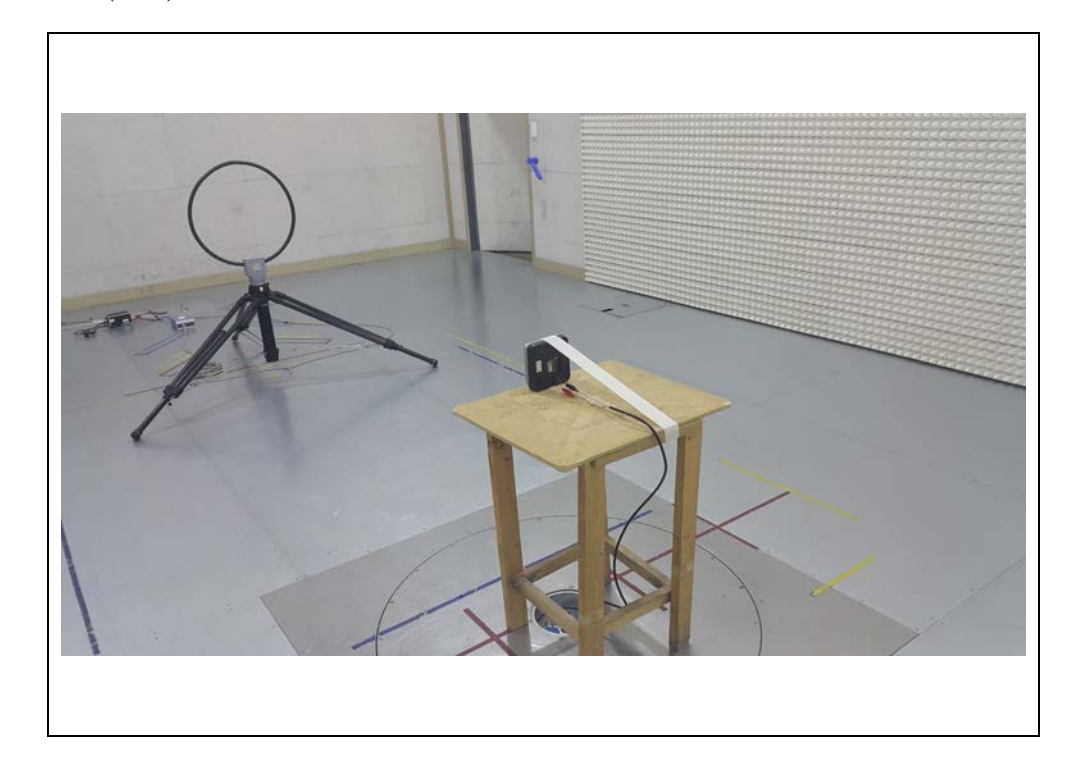
* 30 Mz ~ 1 GHz