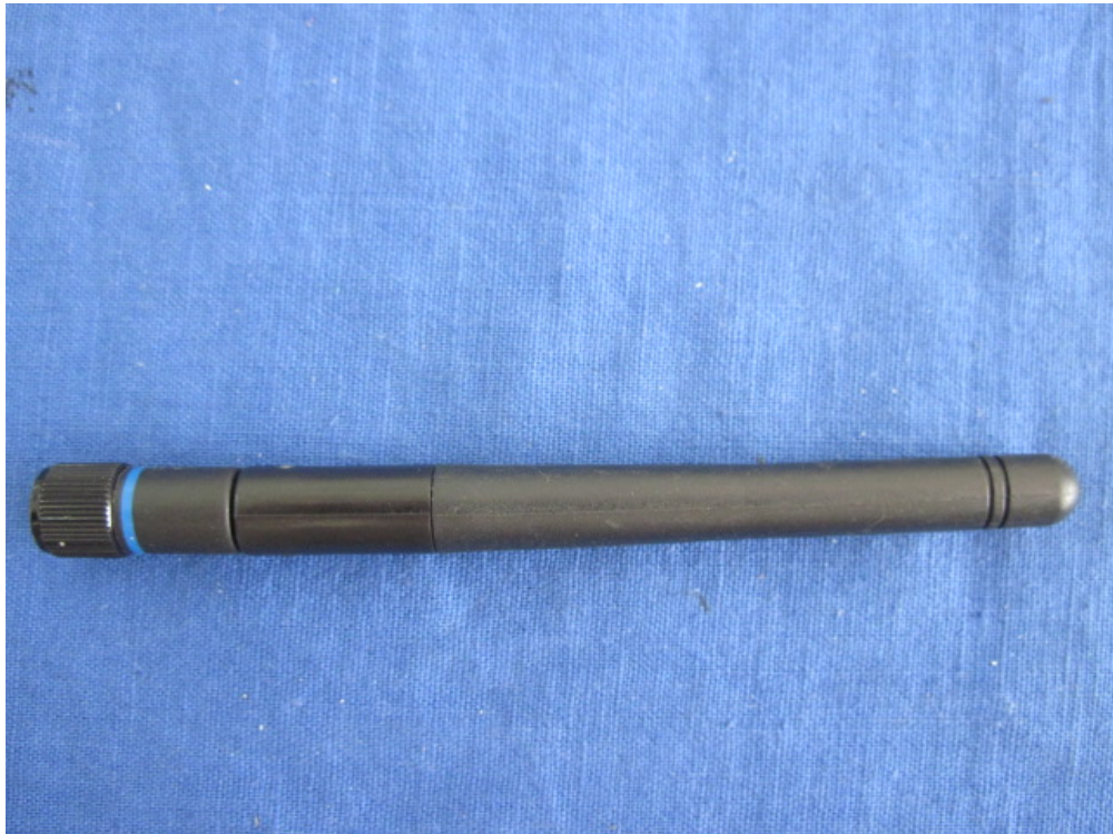
(6) EUT Photo (2dBi gain)