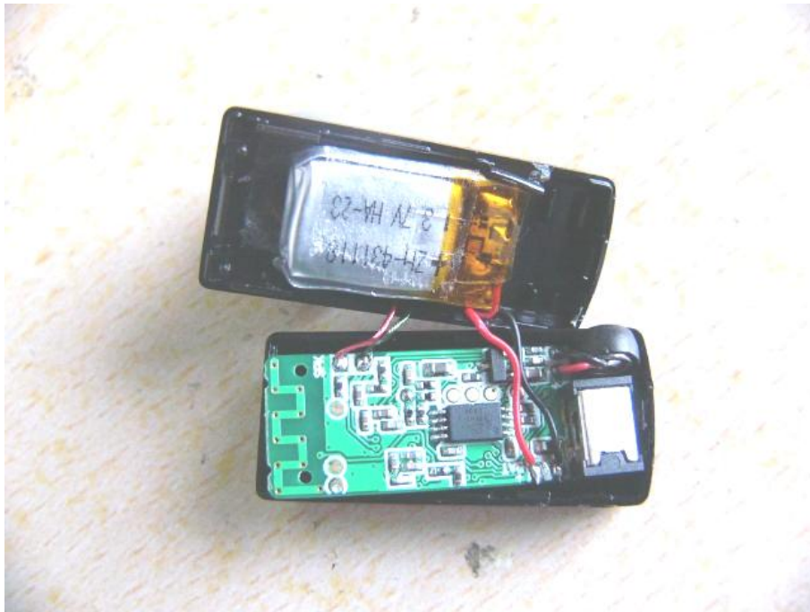
Main board component side