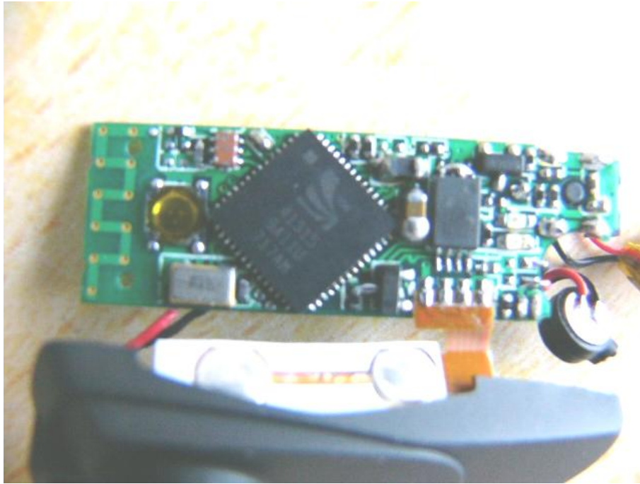
Main board solder side