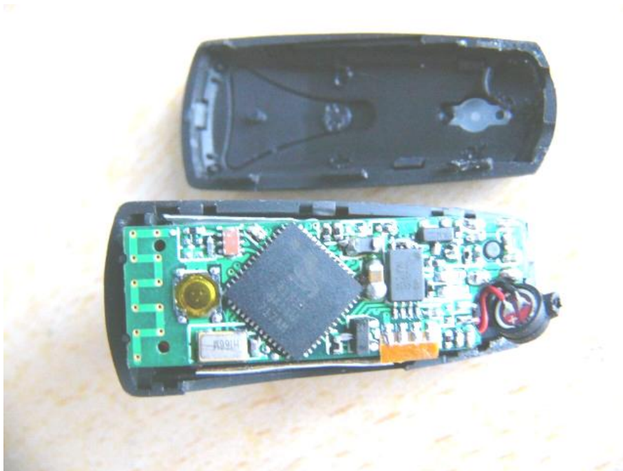
Main board component side