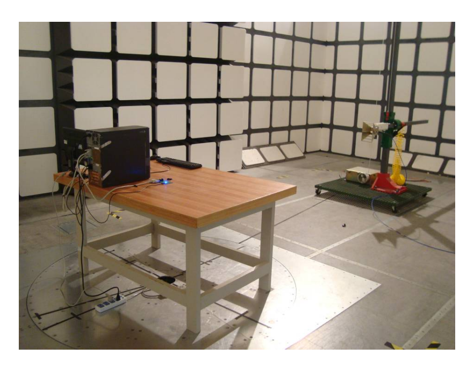
Above 1 GHz: Spurious Radiated Emissions - Rear View