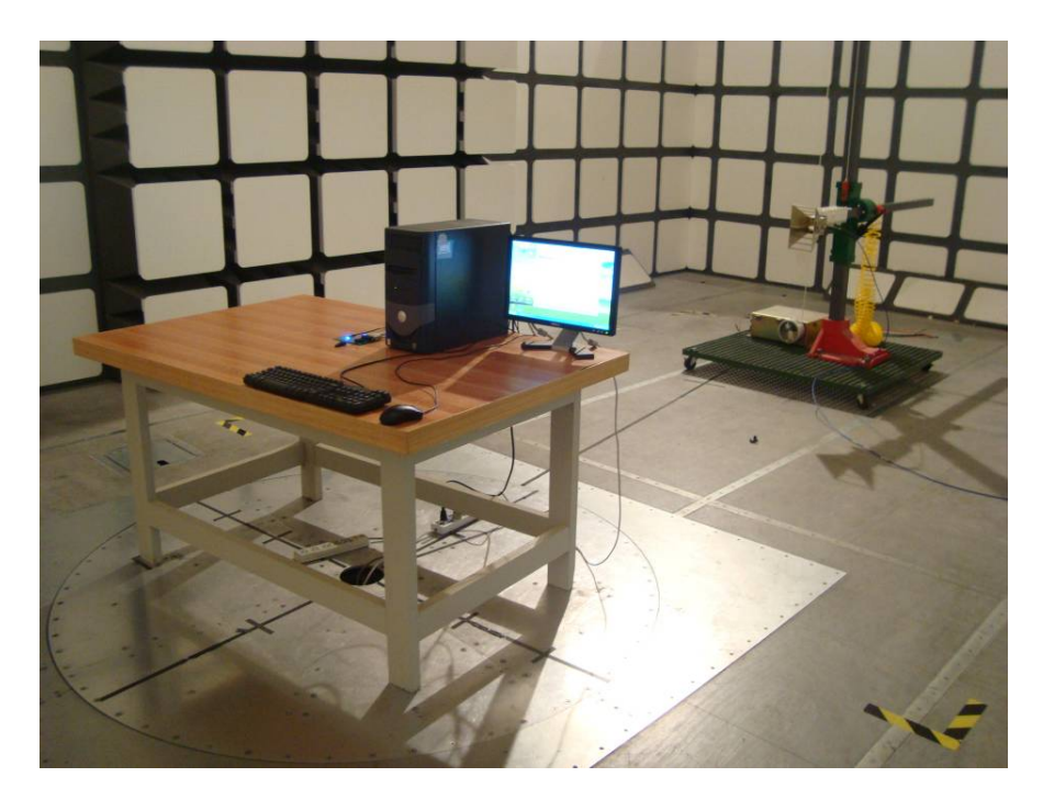
Above 1 GHz: Spurious Radiated Emissions - Front View