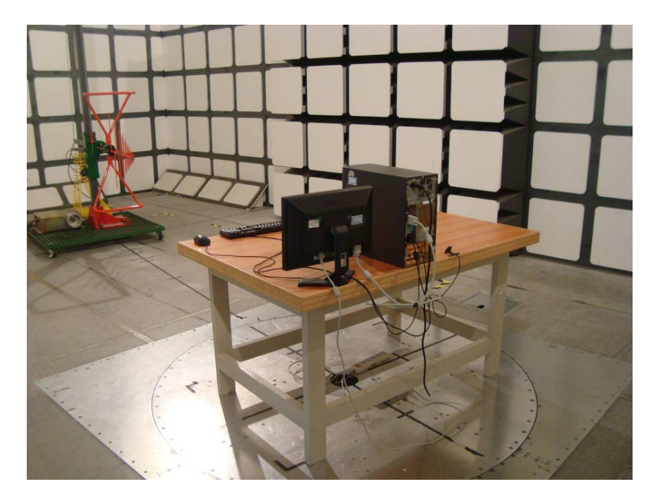
Below 1 GHz: Spurious Radiated Emissions - Rear View (Charging mode)

Below 1 GHz: Spurious Radiated Emissions - Front View (Charging mode)