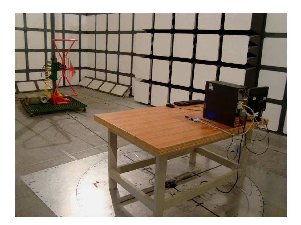
Below 1 GHz: Spurious Radiated Emissions - Rear View (Transmitting mode)

Below 1 GHz: Spurious Radiated Emissions - Front View (Transmitting mode)