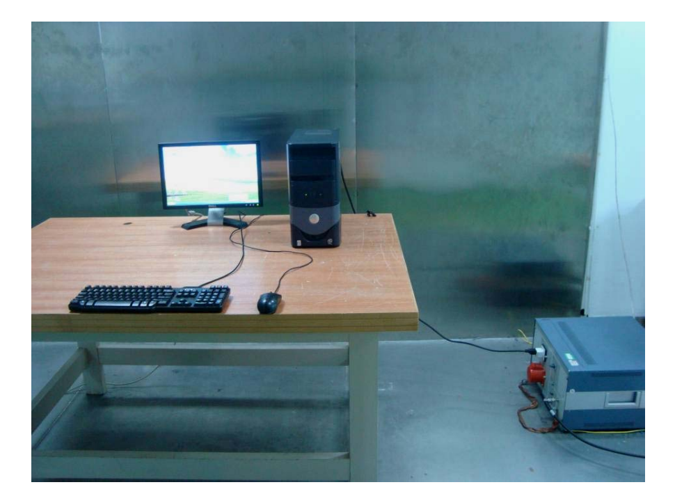
EXHIBIT D - TEST SETUP PHOTOGRAPHS