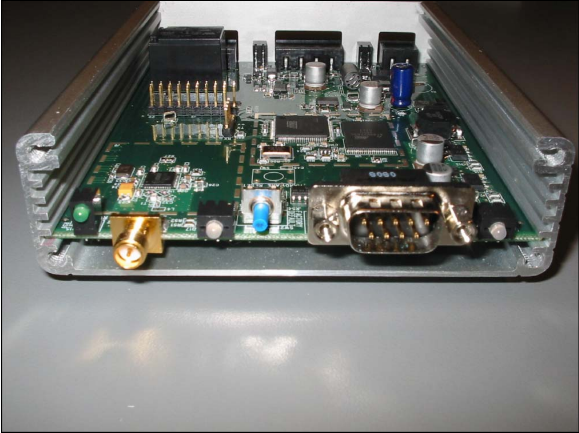
Photograph 3. LRT 04 - End View Board Installation(1)