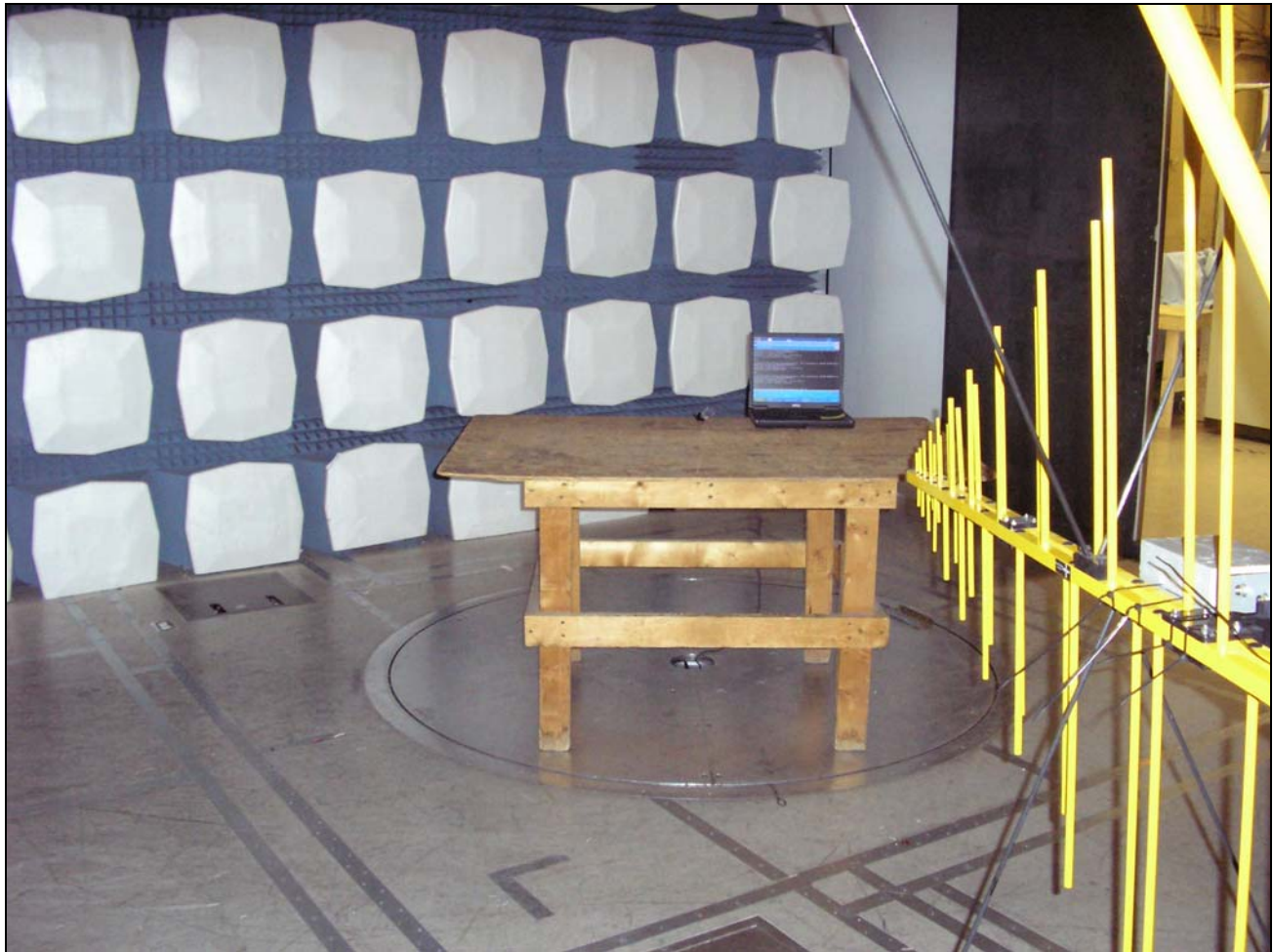
Photograph 1. Radiated Emission Limits Test Setup