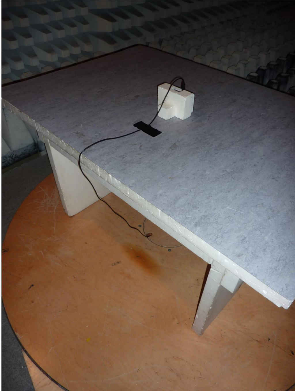
172414_6.jpg: EasyScan USB, test set-up fully anechoic chamber