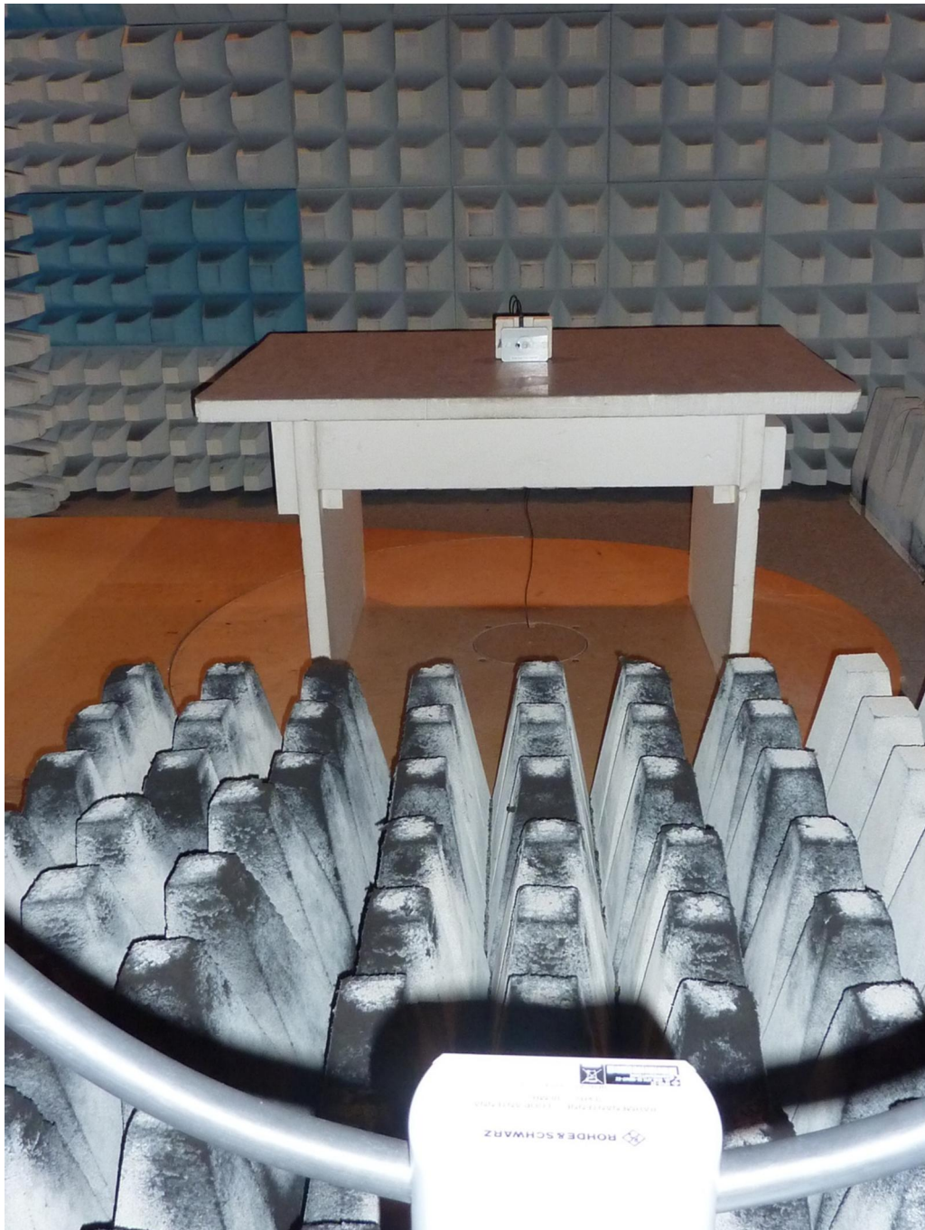
172414_8.jpg: EasyScan USB, test set-up fully anechoic chamber