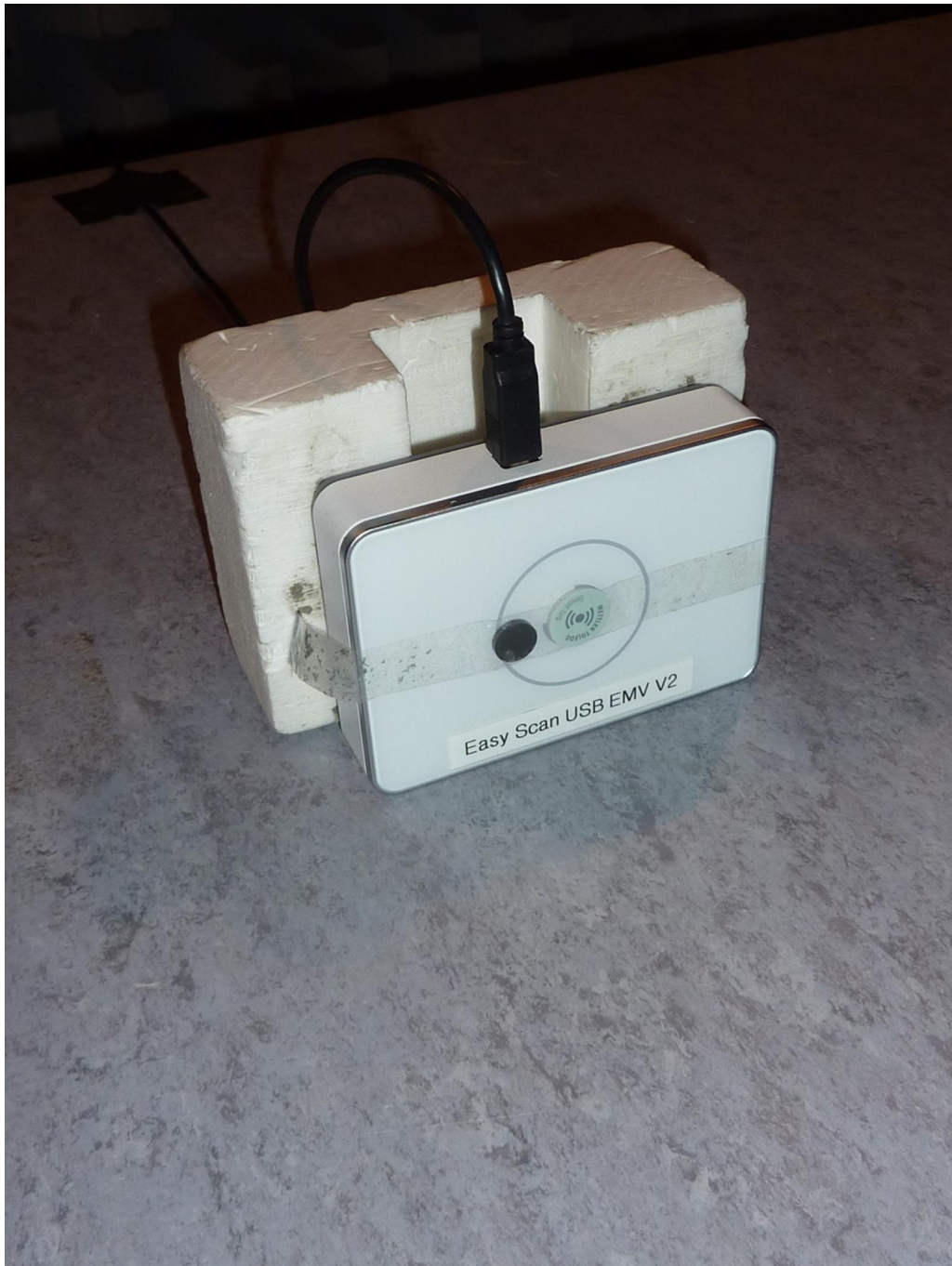
172414_7.jpg: EasyScan USB, test set-up fully anechoic chamber