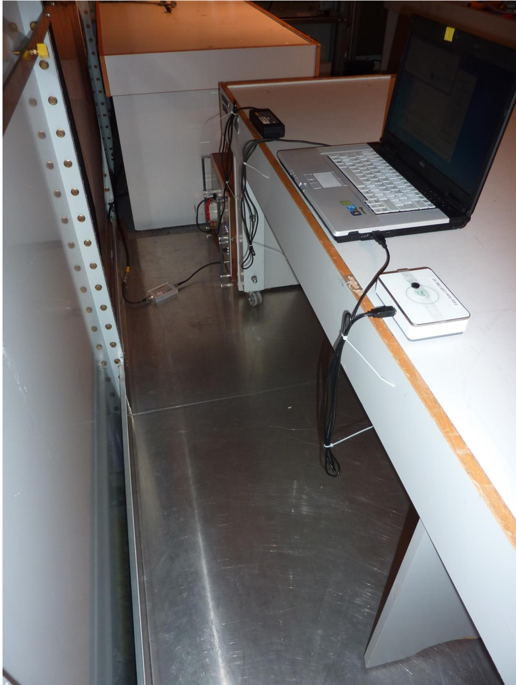
172414_26.jpg: EasyScan USB, test set-up shielded chamber