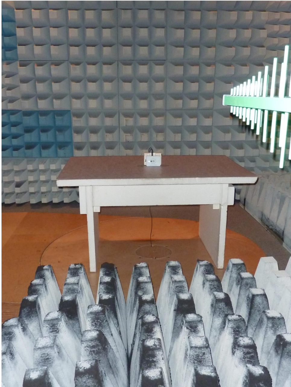
172414_9.jpg: EasyScan USB, test set-up fully anechoic chamber