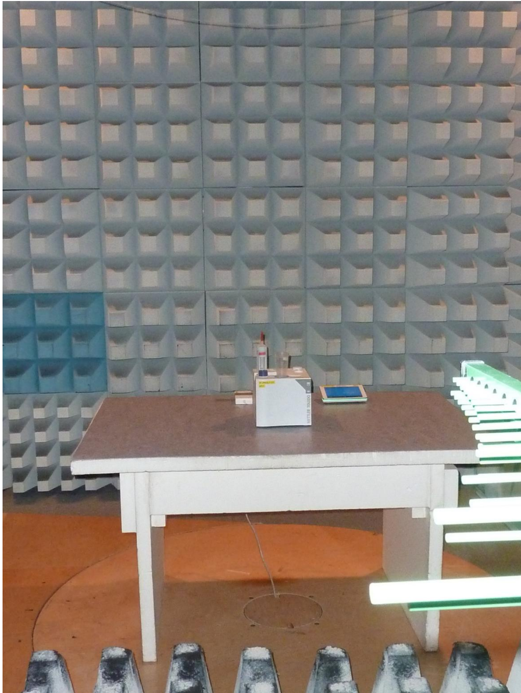
161791emiB3.jpg: Host (Excellence Titrator T9), test setup fully anechoic chamber