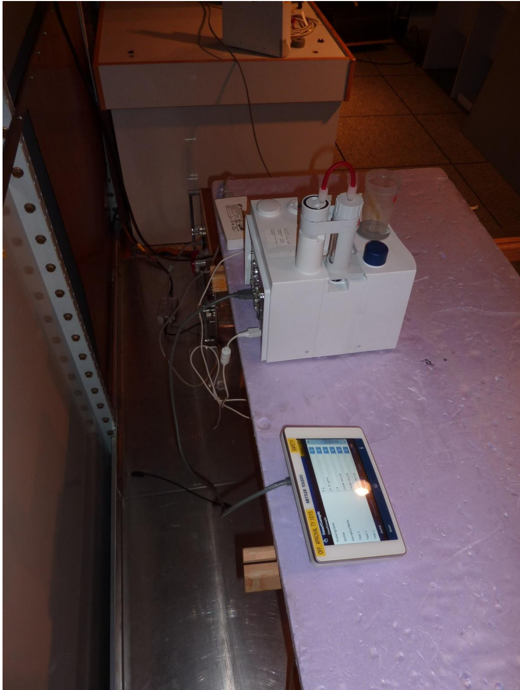
161791emicB1.jpg: Host (Excellence Titrator T9), test setup shielded chamber