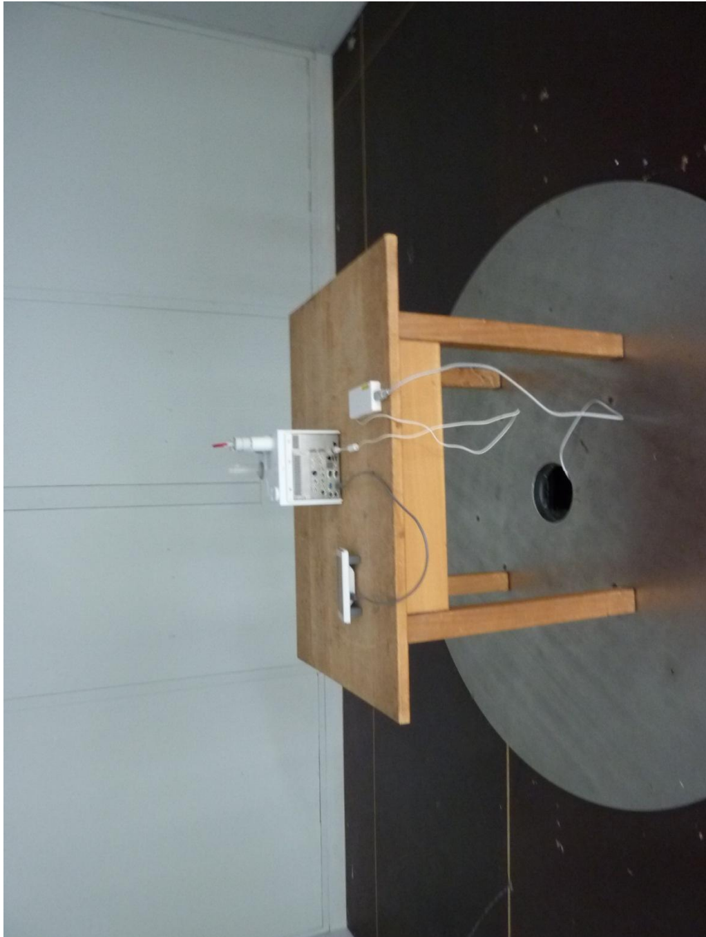
161791emiB5.jpg: Host (Excellence Titrator T9), test setup open area test site