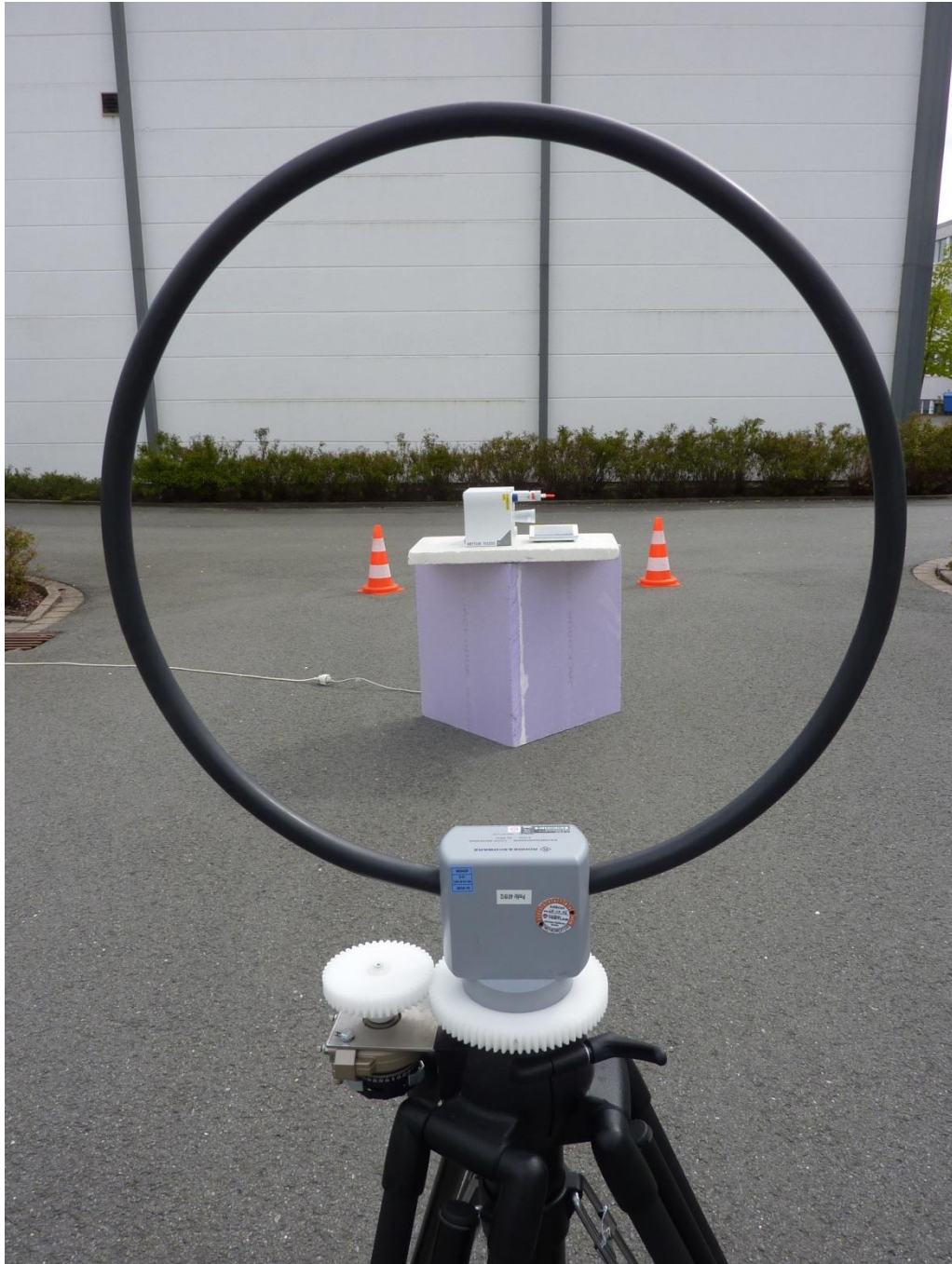
161791emiB4.jpg: Host (Excellence Titrator T9), test setup outdoor test site