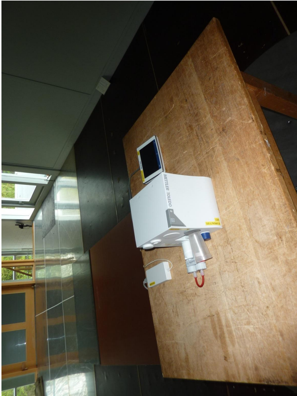
161791emiB6.jpg: Host (Excellence Titrator T9), test setup open area test site