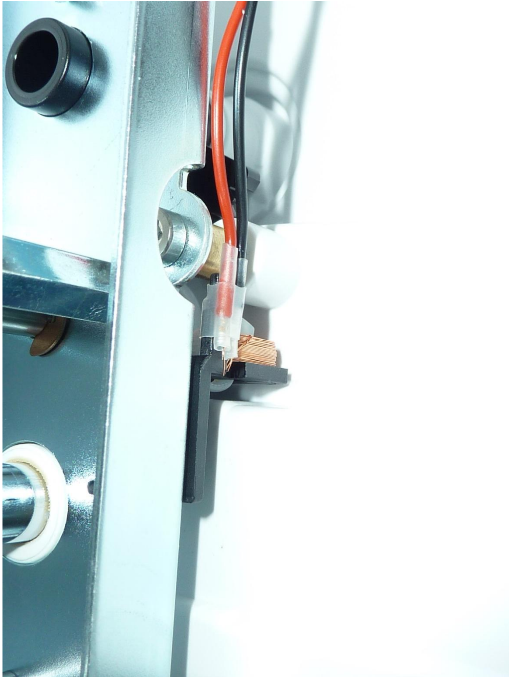
161791eut29.jpg: EUT (125 kHz RFID Module), antenna installation