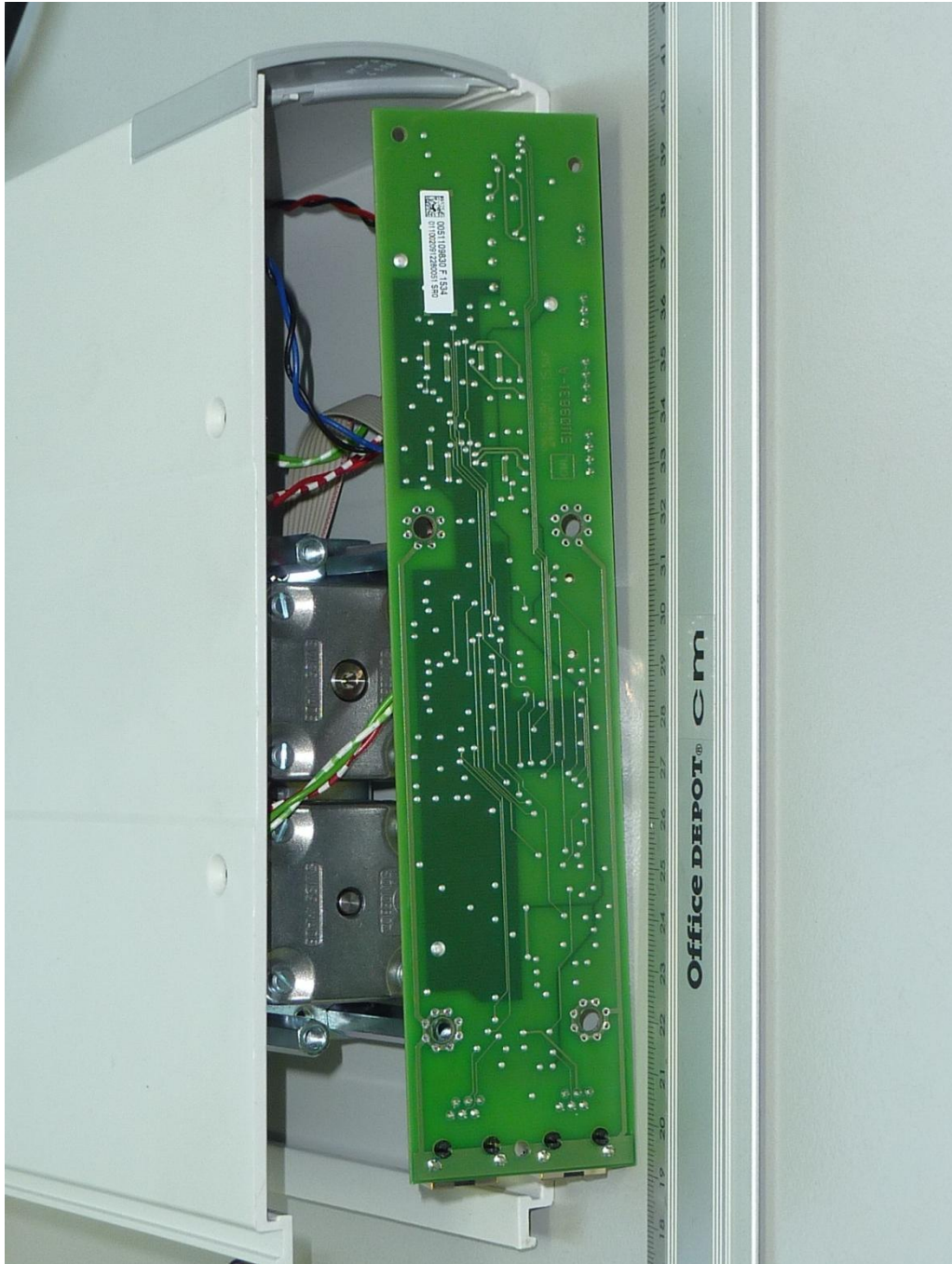
161791pcbH1.jpg: EUT (125 kHz RFID Module), PCB, bottom view