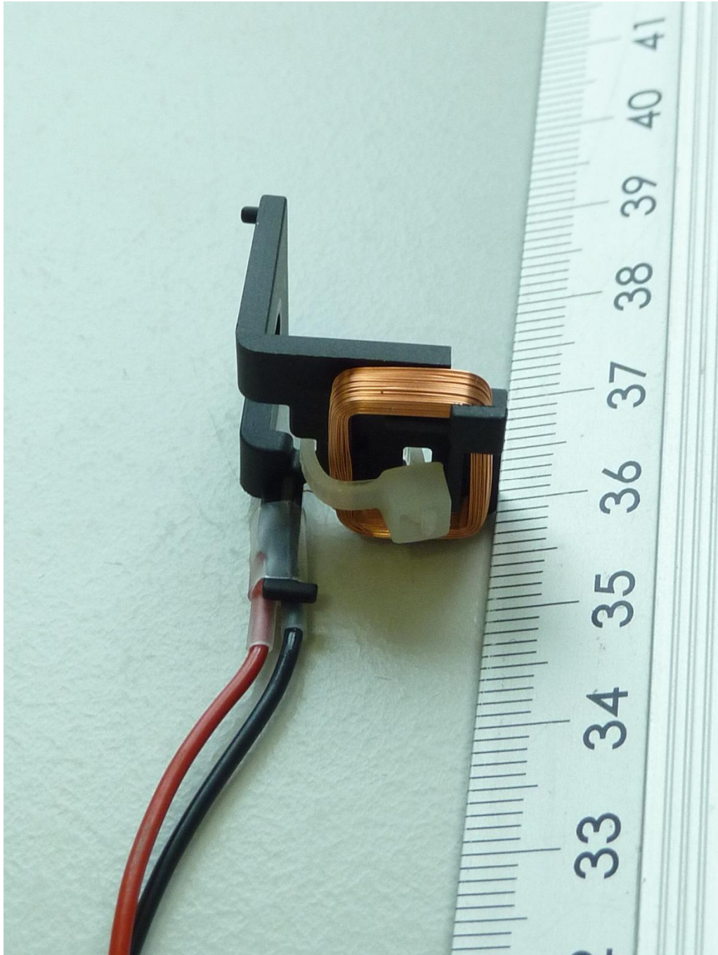
161791eut30.jpg: EUT (125 kHz RFID Module), antenna