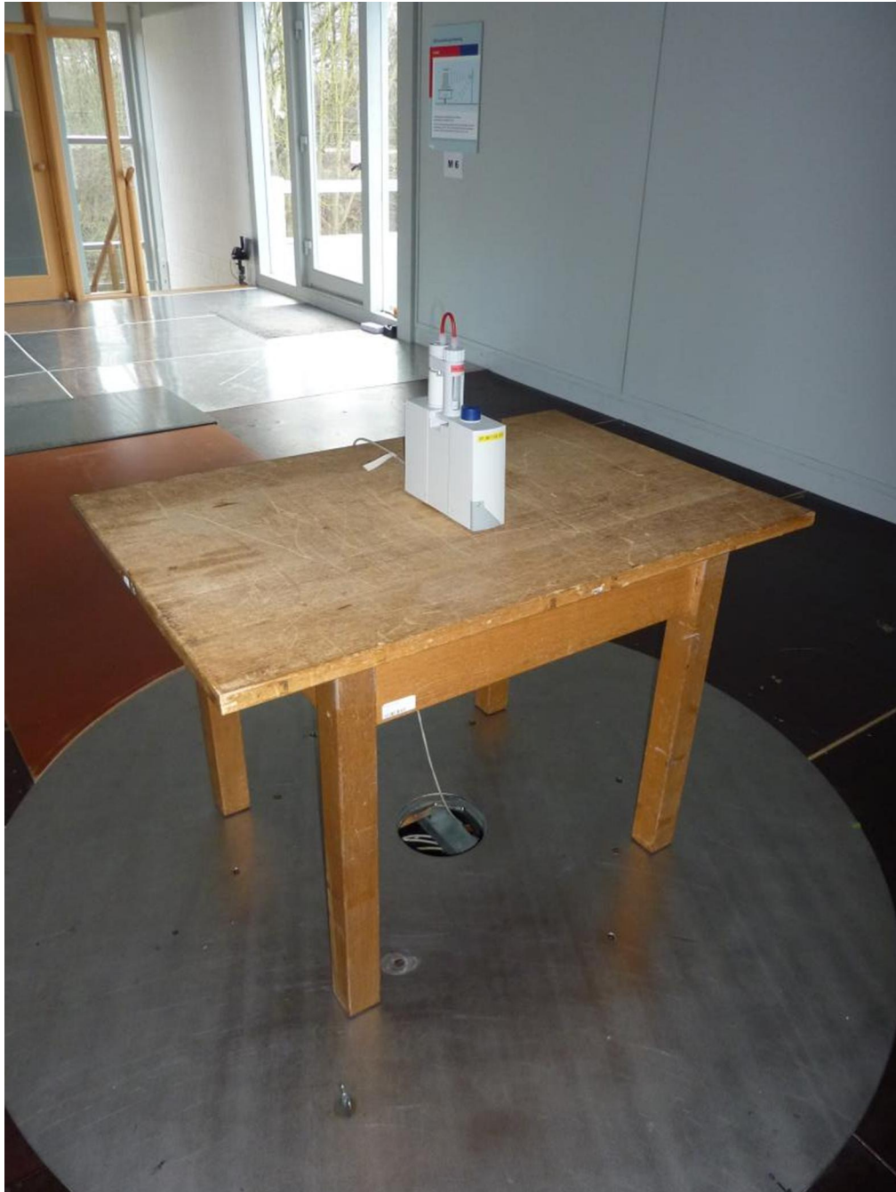
161791emiC4.jpg: Host (Dosing Unit), test setup open area test site position 1