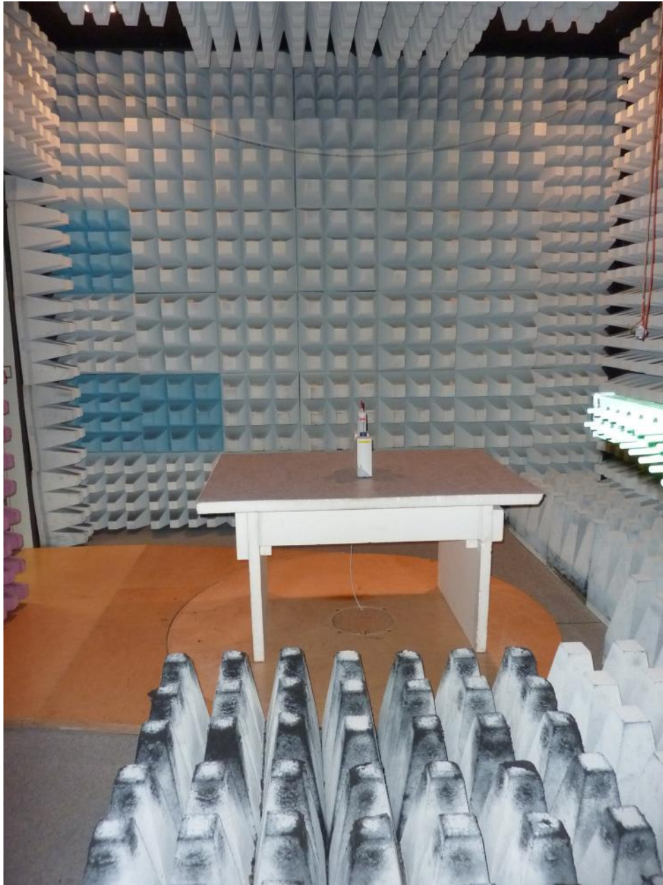
161791emiC2.jpg: Host (Dosing Unit), test setup fully anechoic chamber