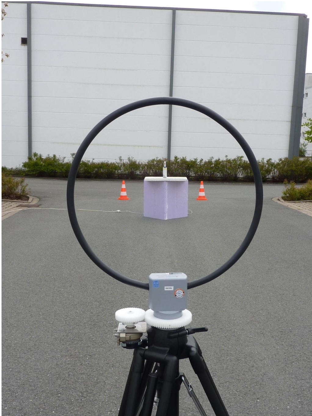
161791emiC6.jpg: Host (Dosing Unit), test setup outdoor test site