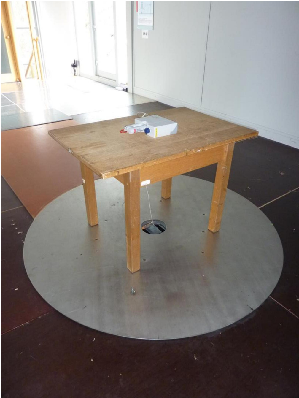
161791emiC5.jpg: Host (Dosing Unit), test setup open area test site position 2