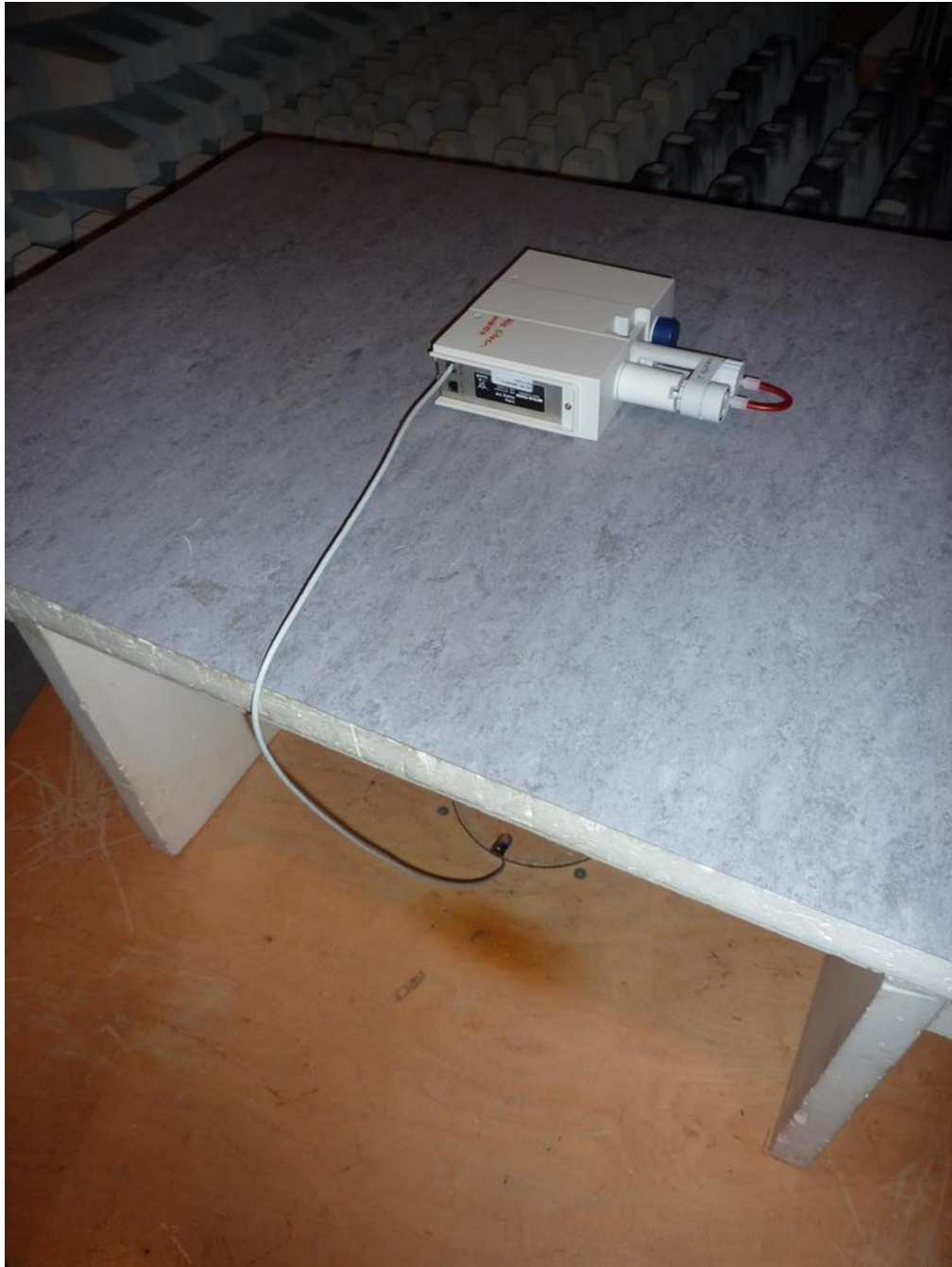
161791emiC3.jpg: Host (Dosing Unit), test setup fully anechoic chamber