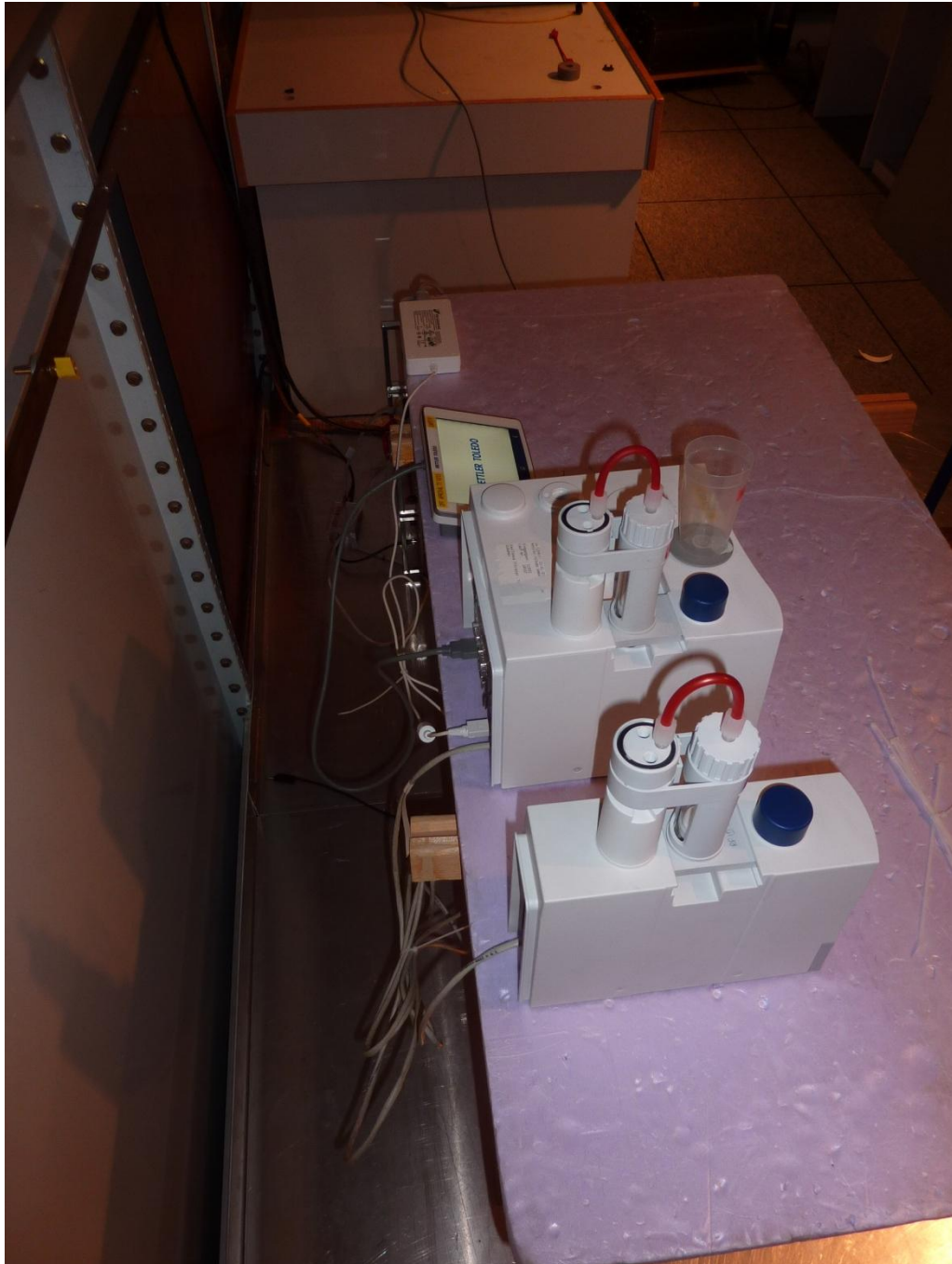
161791emicC1.jpg: Host and support device, test setup shielded chamber