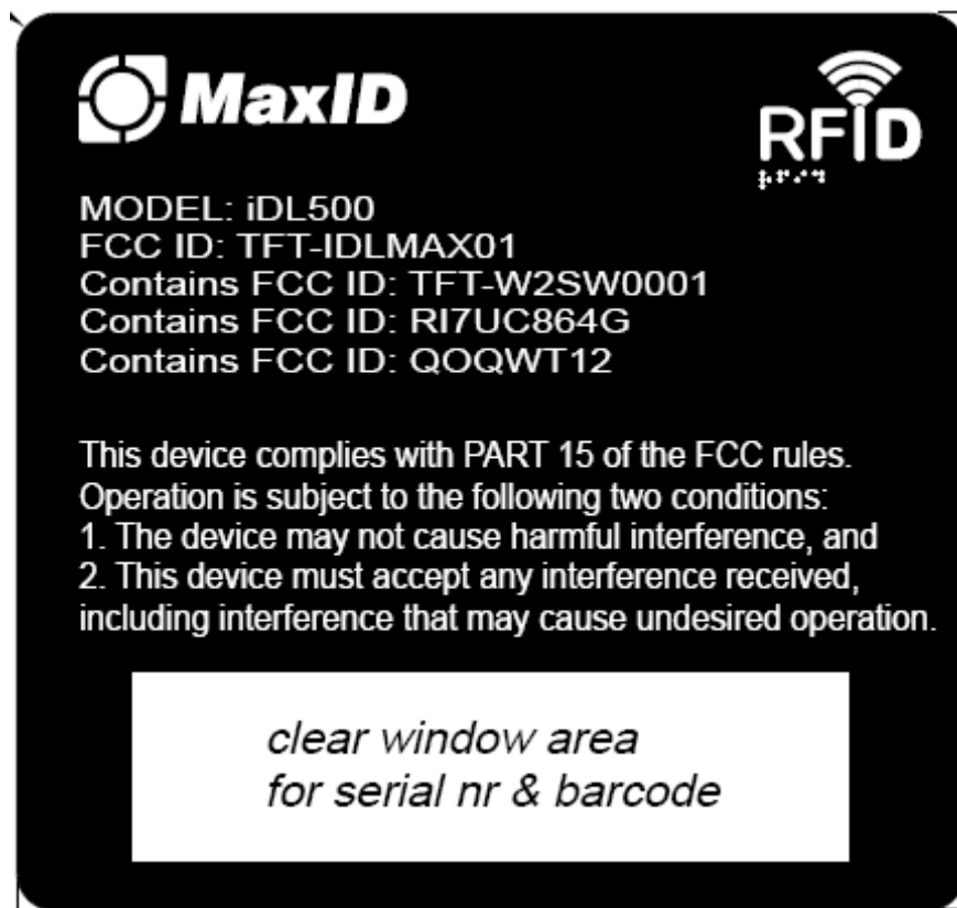
Figure 1: Label Sample