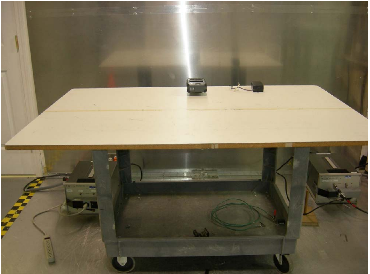
Figure 7: Conducted Emissions