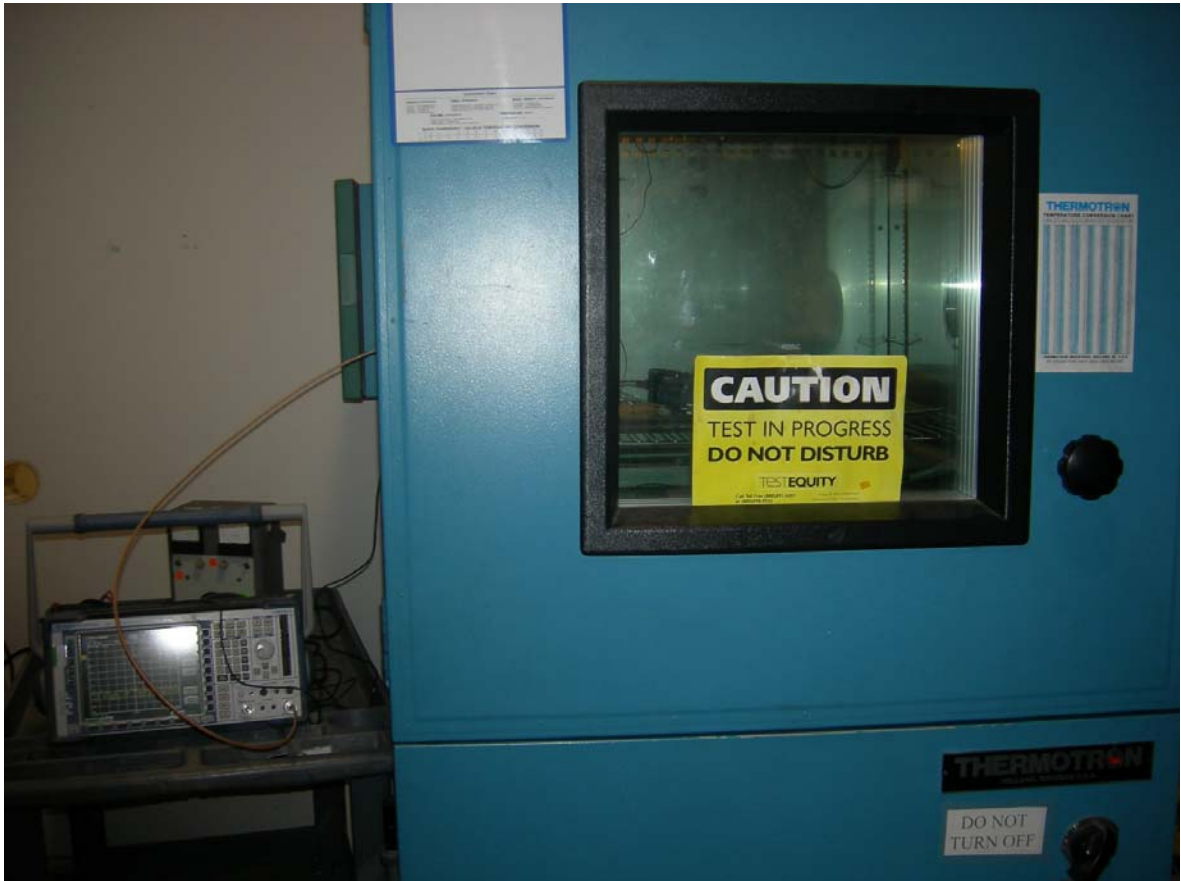
Figure 5: Frequency Stability