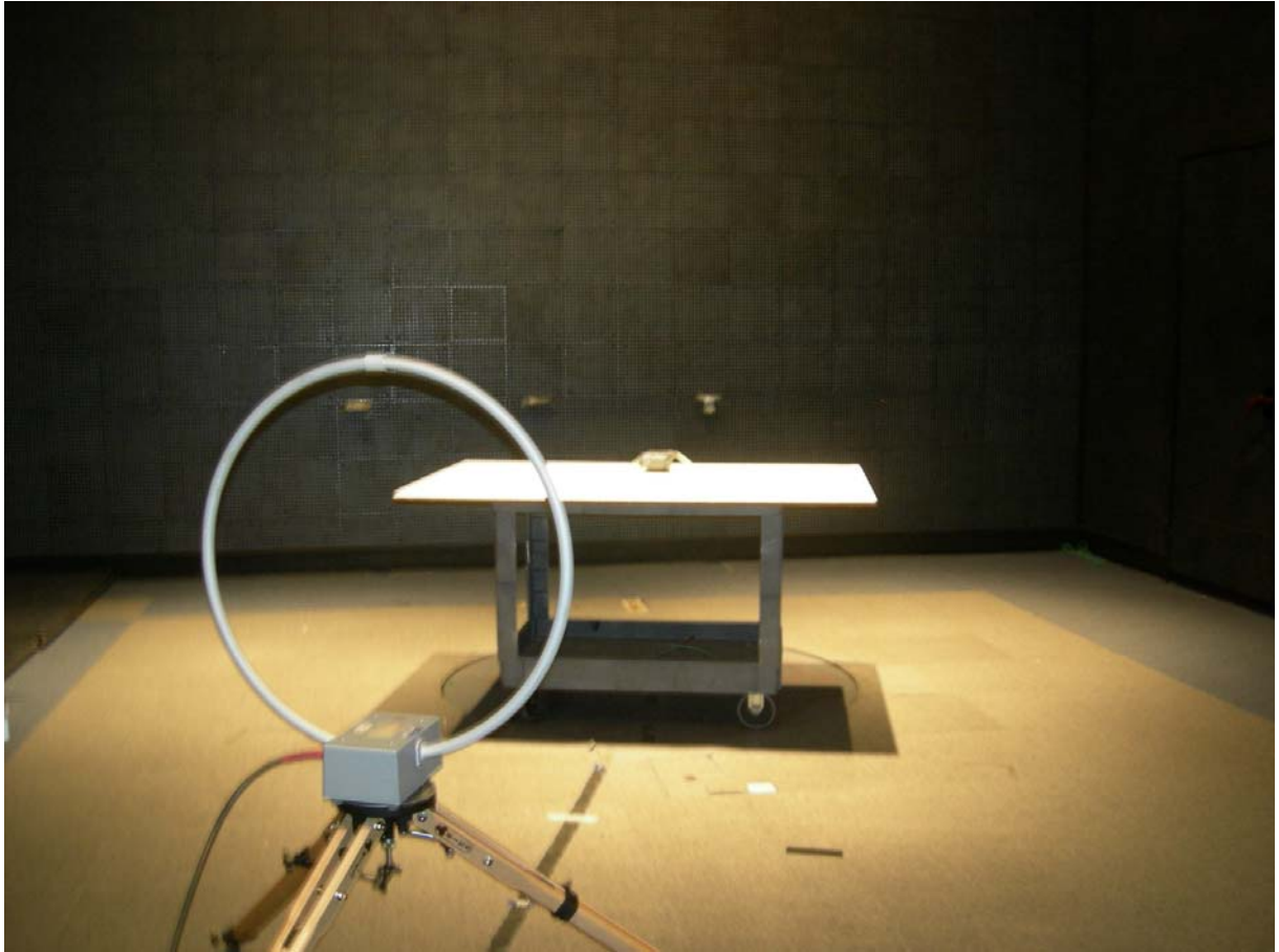
Figure 2: Radiated Emissions < 30MHz