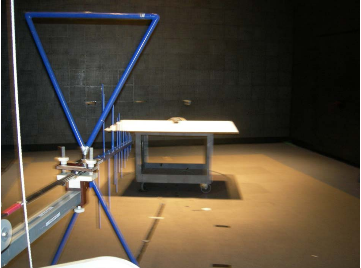
Figure 3: Radiated Emissions 30 - 1000 MHz