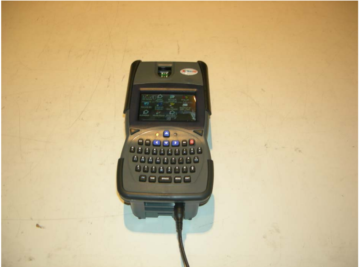
Figure 1: Radiated Emissions EUT Setup