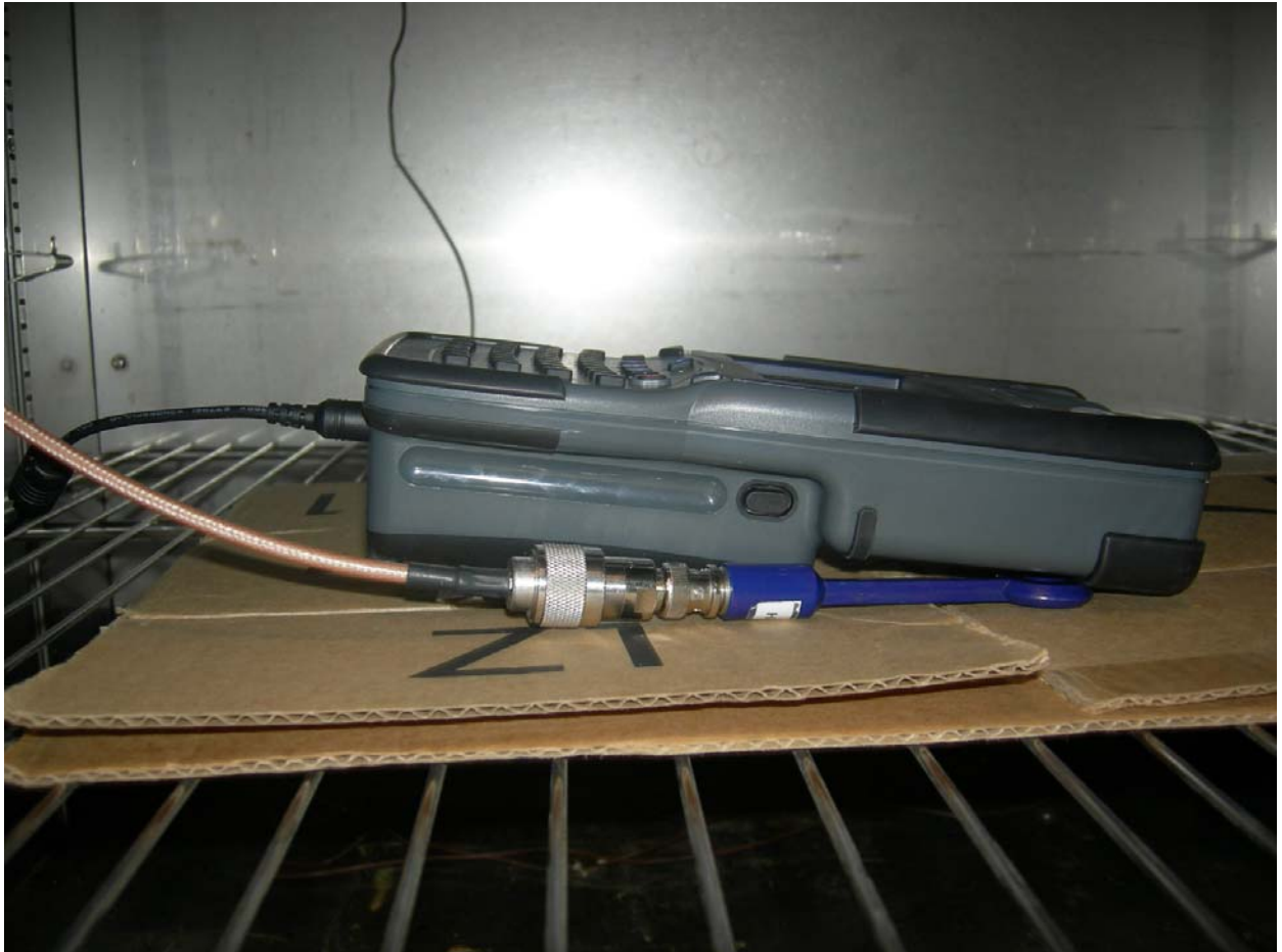
Figure 6: Frequency Stability