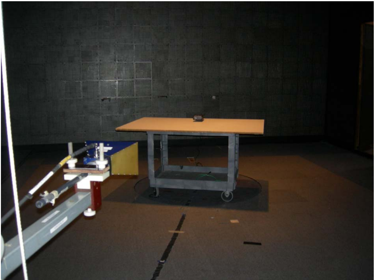
Figure 4: Radiated Emissions > 1000 MHz