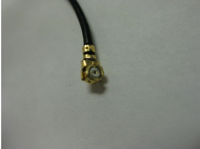
Close Up of Connector #3