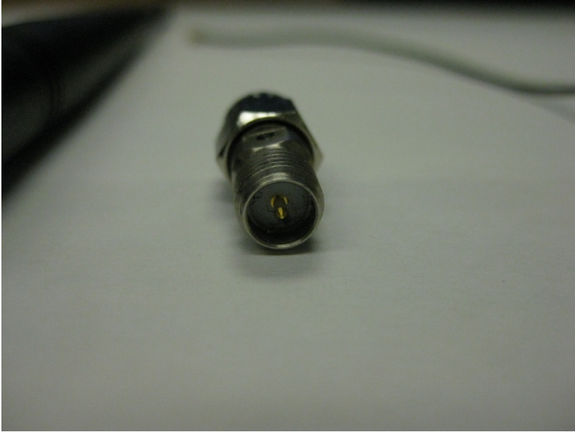
Connector #2, View 1