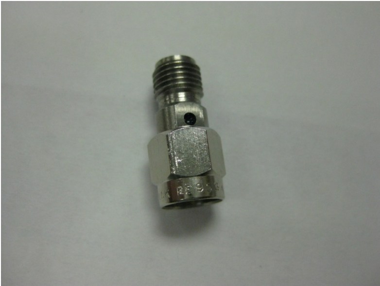
Connector #2 Full View