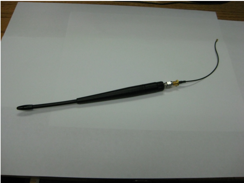
View of DiPole Antenna