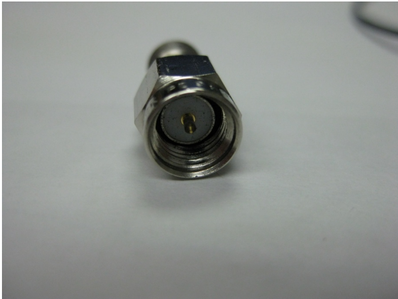
Connector #2, View #2