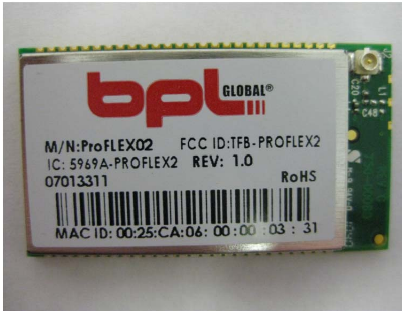
Front side of Board with antenna attached