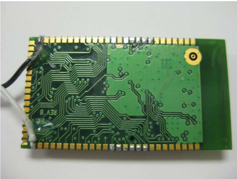
Back Side of Board, View #1