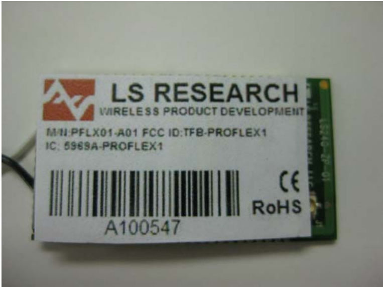
Close up of ID Label