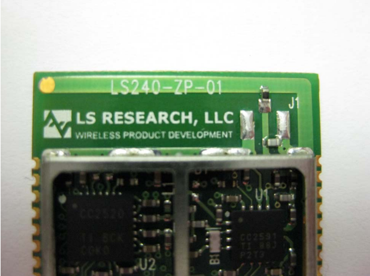
Close Up of PCB Antenna