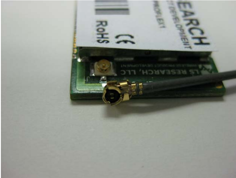
Close Up of External Antenna Connection, View #2