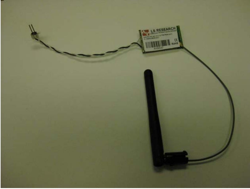
External View-with DiPole Antenna