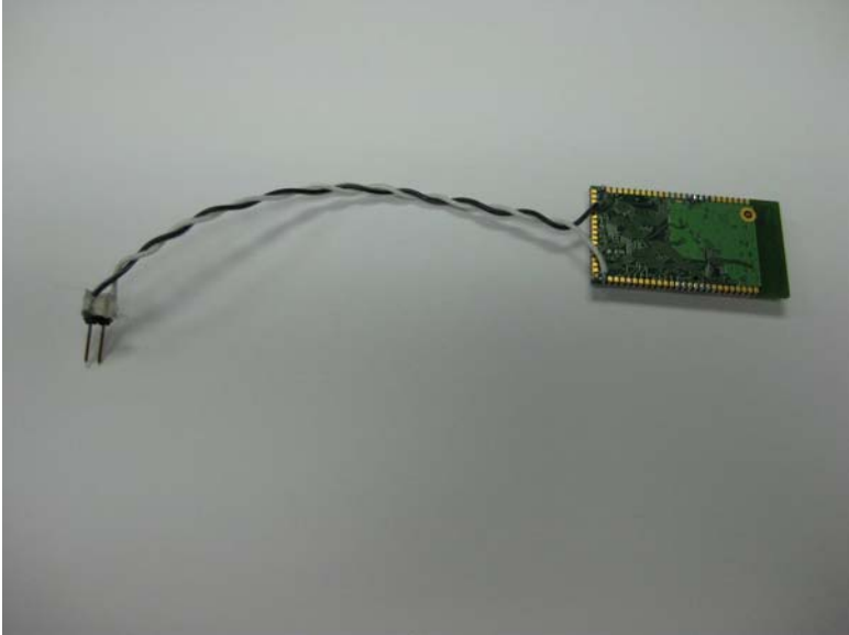
Back Side of Board, View #2