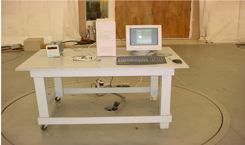
Radiated Test Set-up Front View