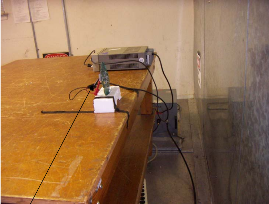
DC connection from laboratory AC-DC power supply