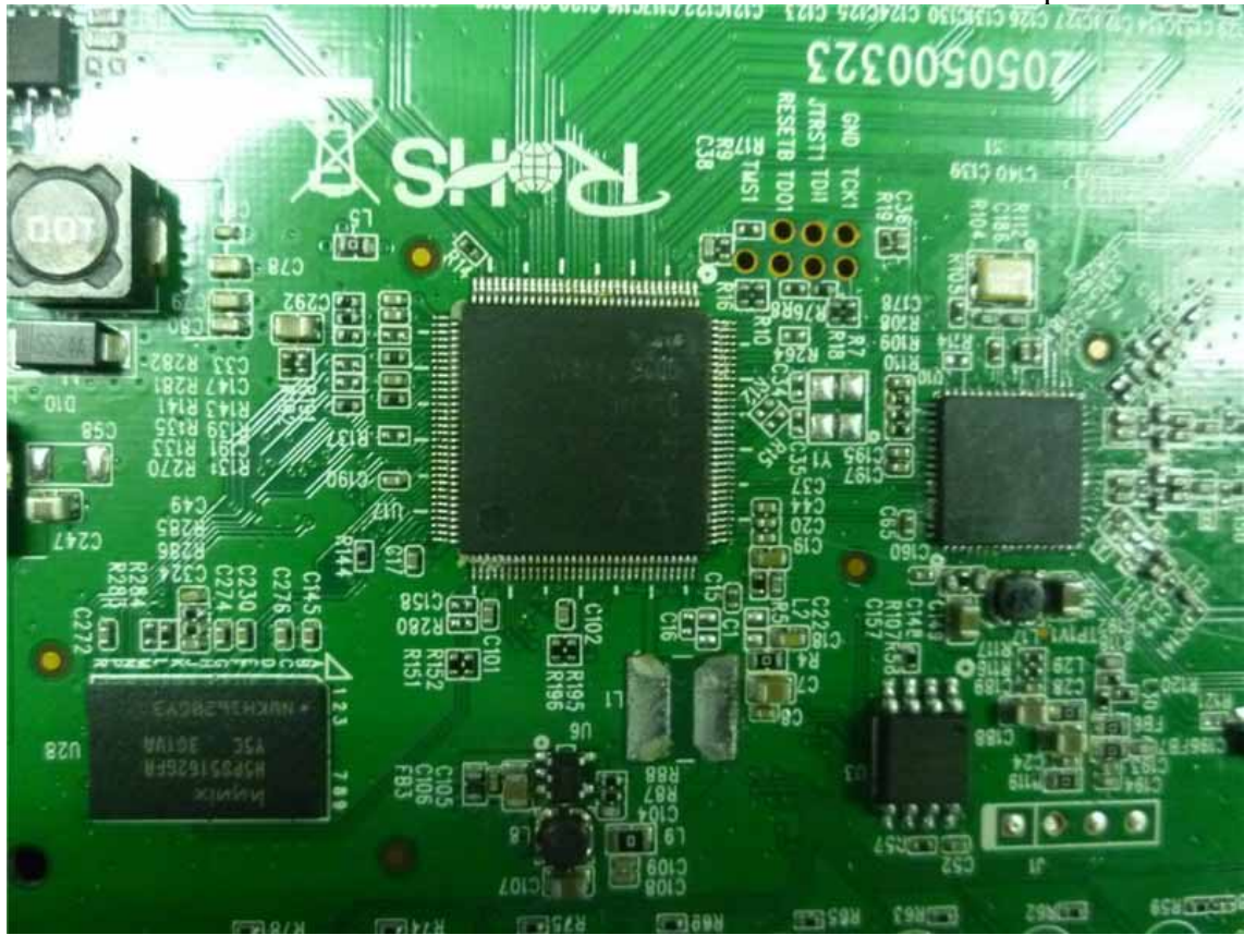
Figure 15 Components Side of the PCB