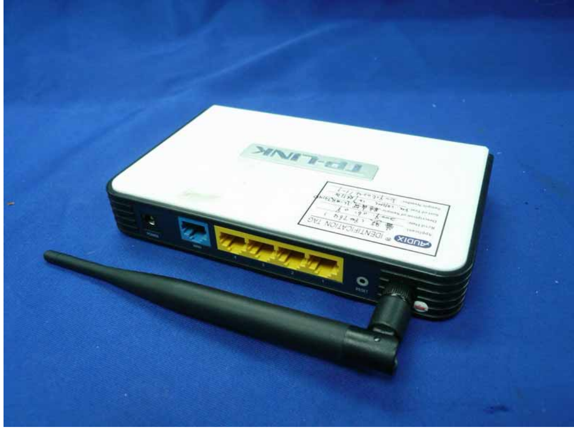
Figure 4 General Appearance of the EUT