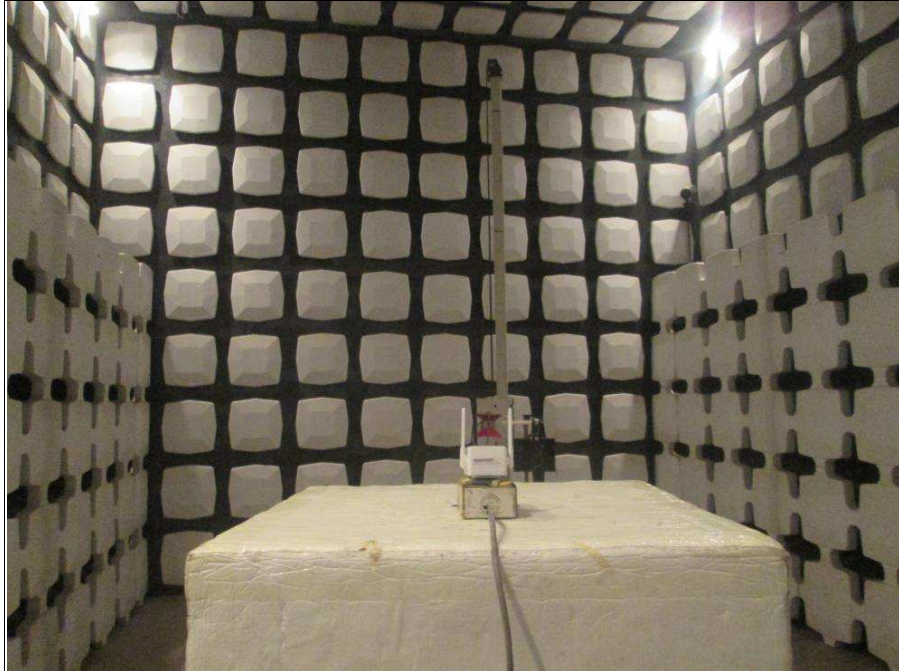
Frequency Range < Above 1GHz >