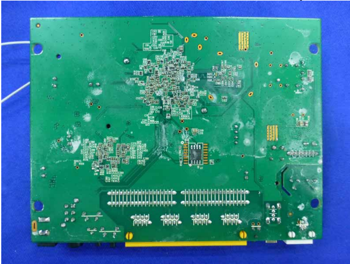
Figure 9 Components Side of the PCB