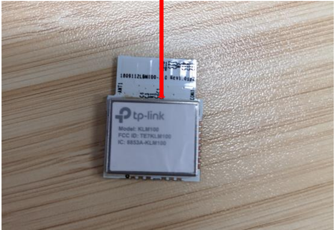
Label and label location