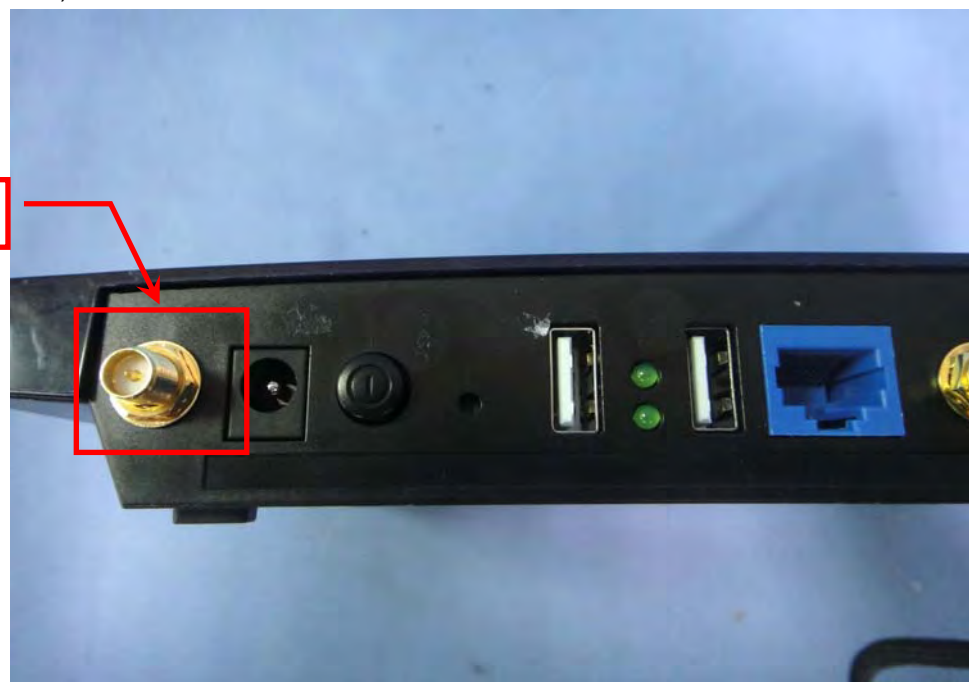
EUT Photo 8 )