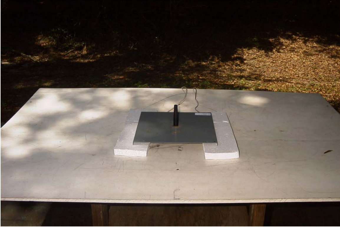
RADIATED EMISSIONS TEST SET UP WITH \frac{1}{4} WAVE ANTENNA-COAX ASSEMBLY, RFM PART NO. 500-1142-001