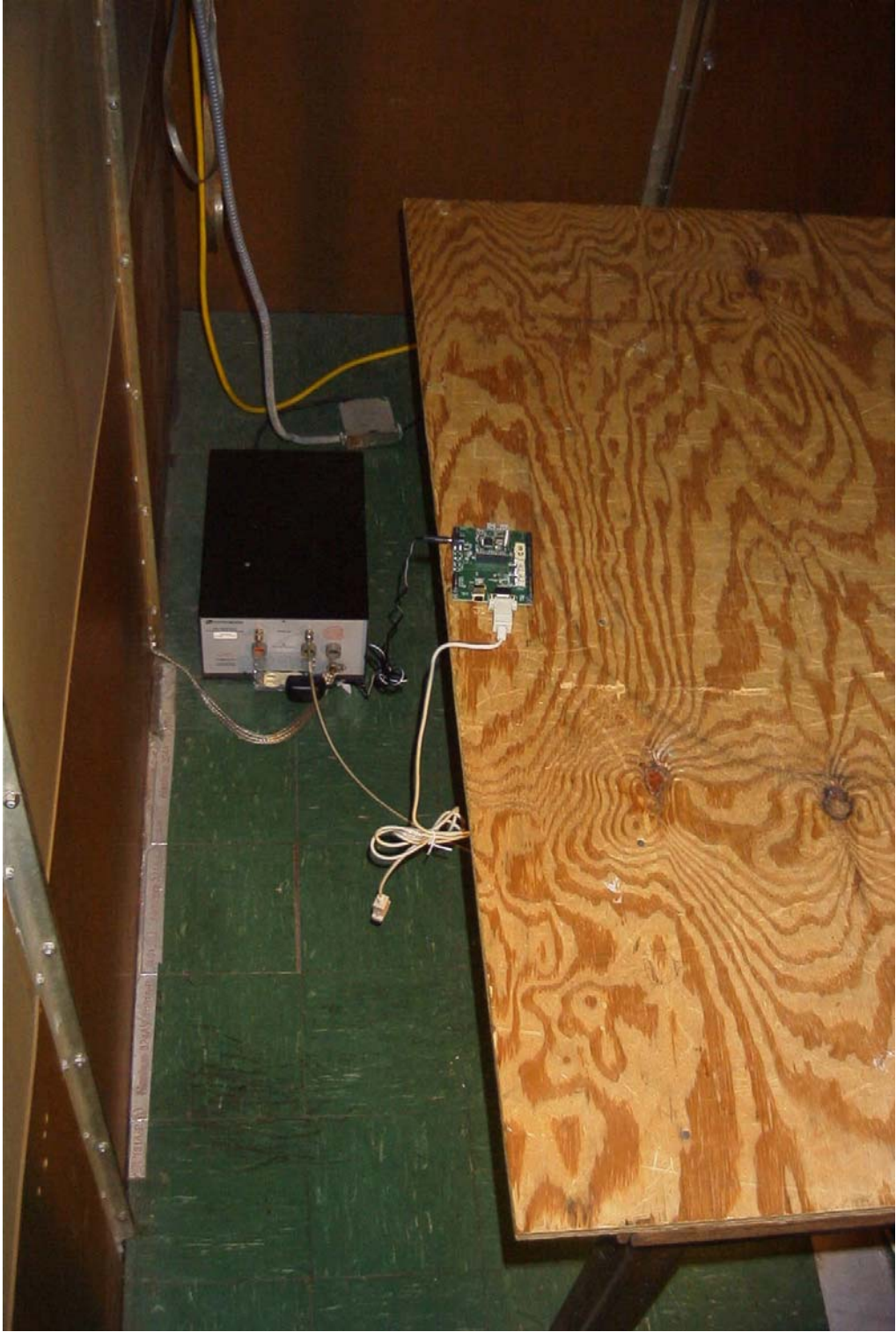
POWERLINE CONDUCTED EMISSIONS TEST SET UP PHOTO