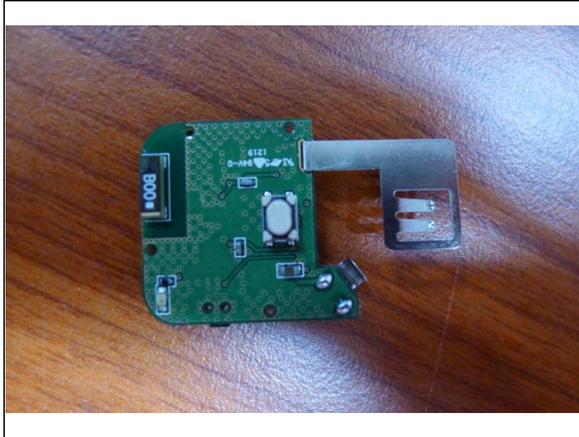
Bottom view of Main PCB