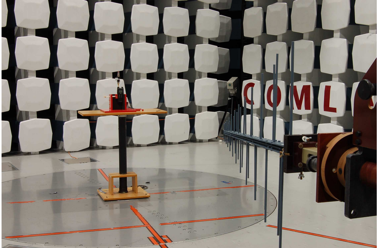
Radiated test 200 - 1000 MHz