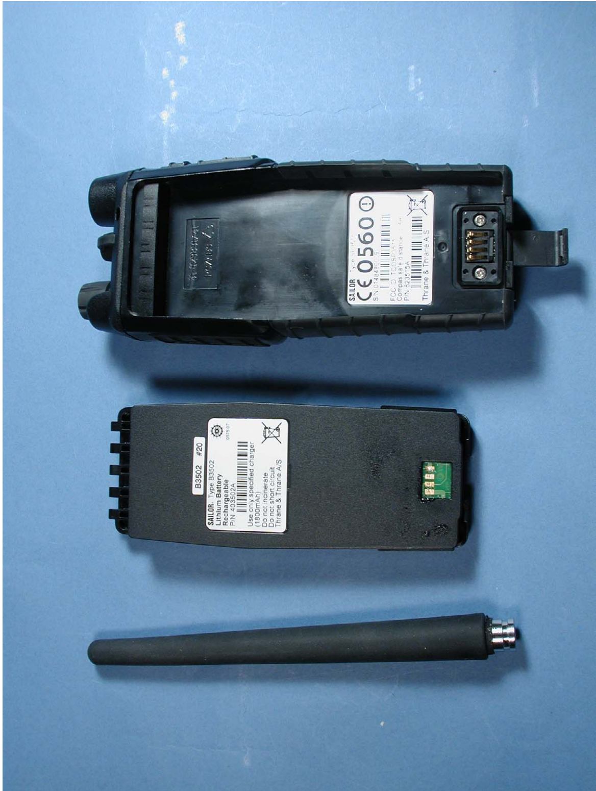
Photograph 1: Exploded view