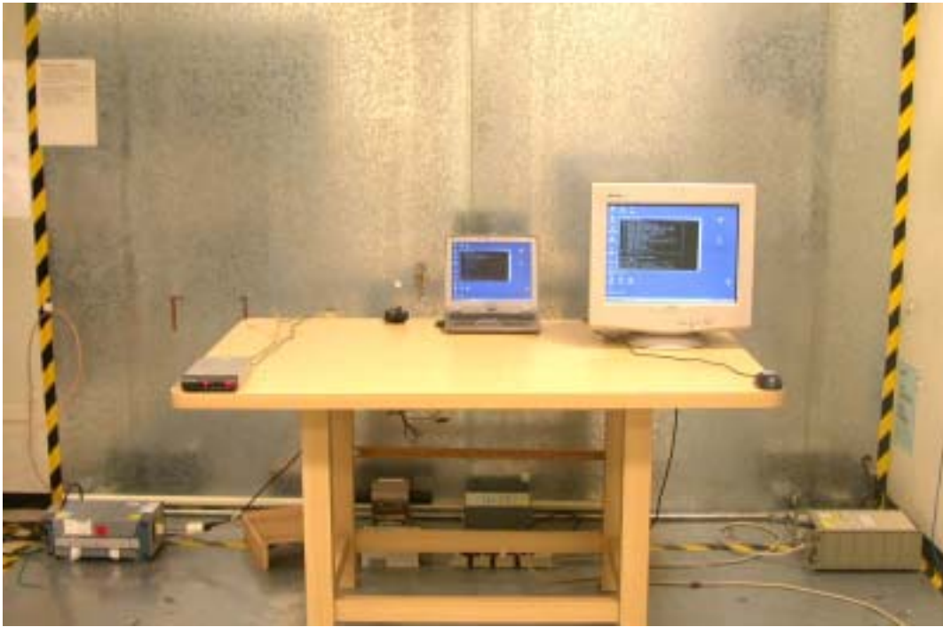
The Front View of Highest Conducted Set-up For EUT