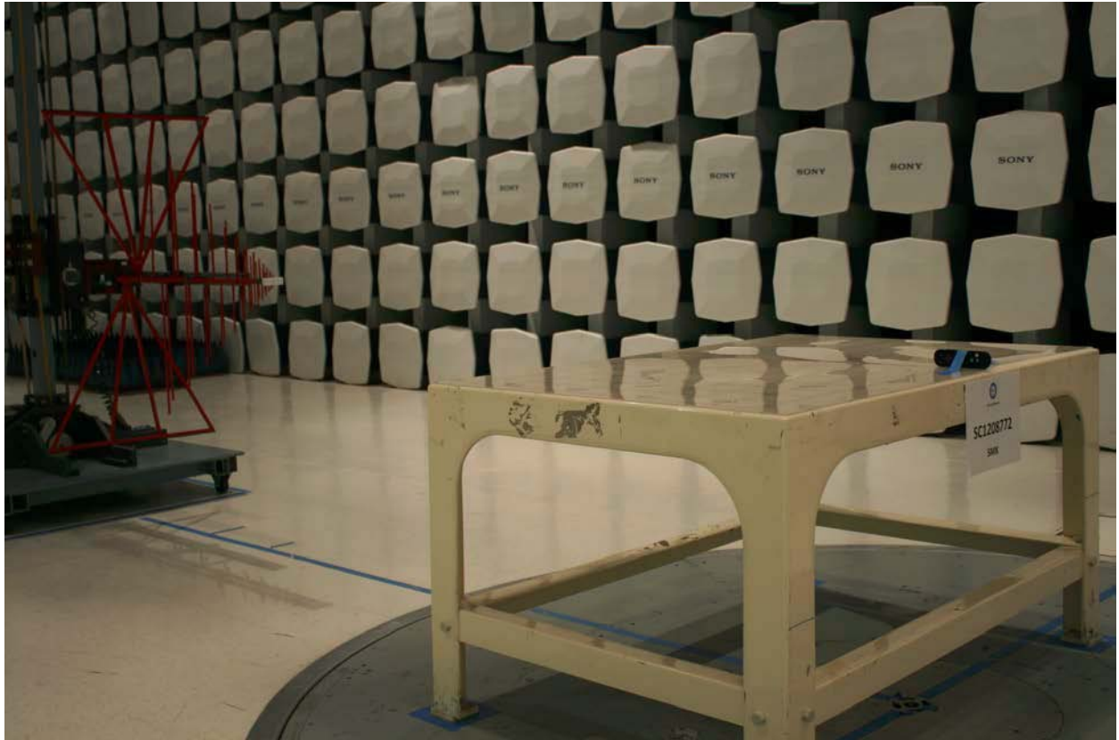
RADIATED EMISSIONS TEST SETUP (BELOW 1GHz)