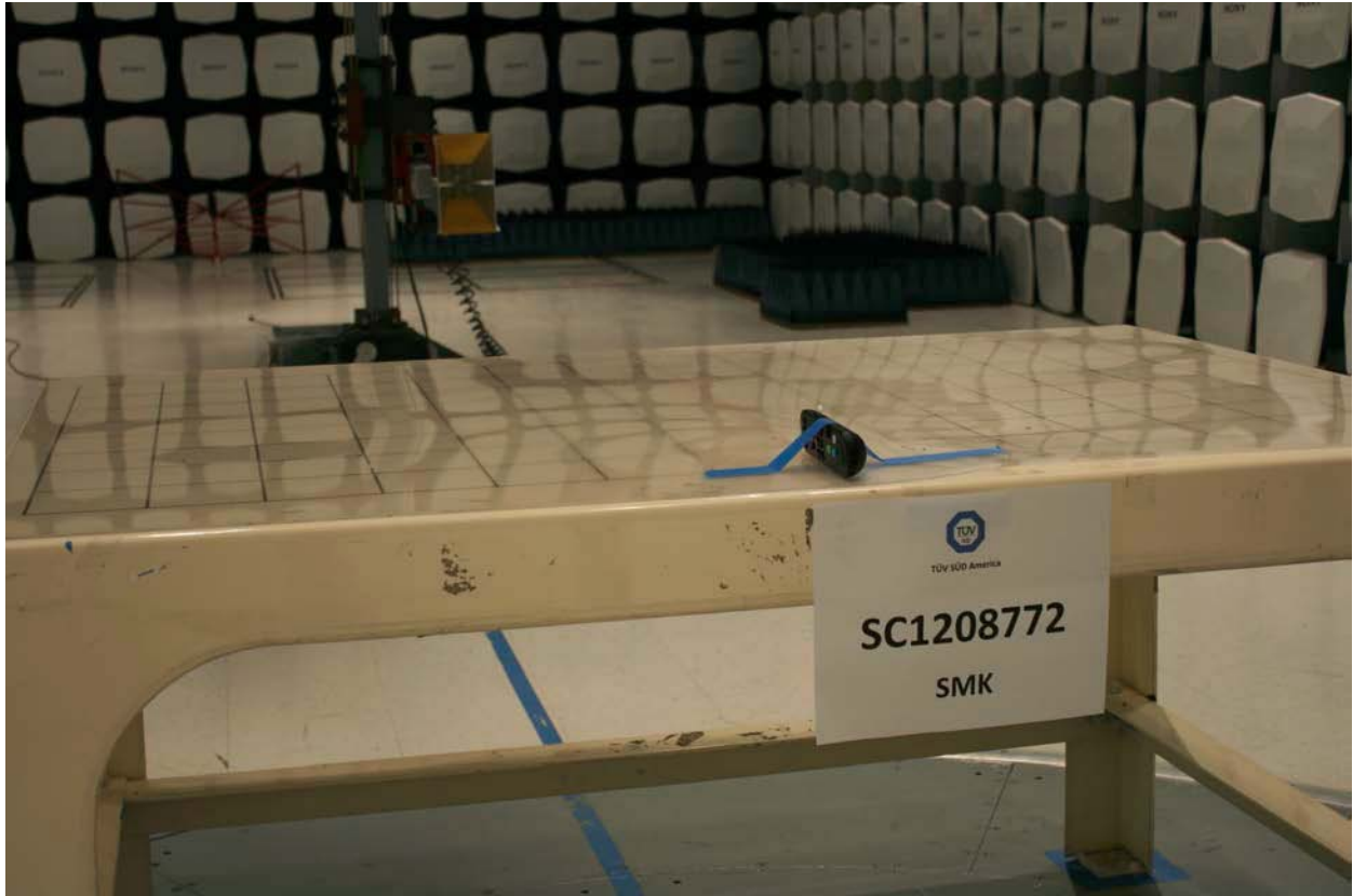
RADIATED EMISSIONS TEST SETUP