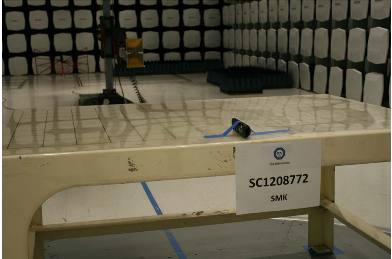
Radiated Emissions Test Setup