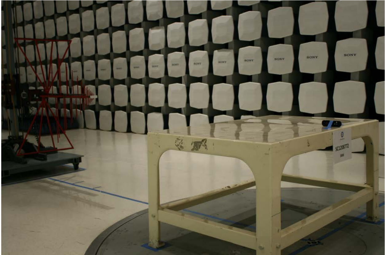
Radiated Emissions Test Setup (below 1GHz)