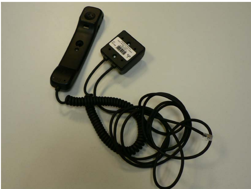
Photograph 4: Equipment under test: AE 2