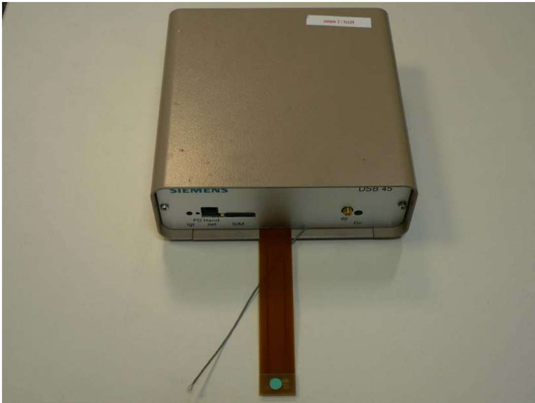
Photograph 3: Equipment under test: AE 1