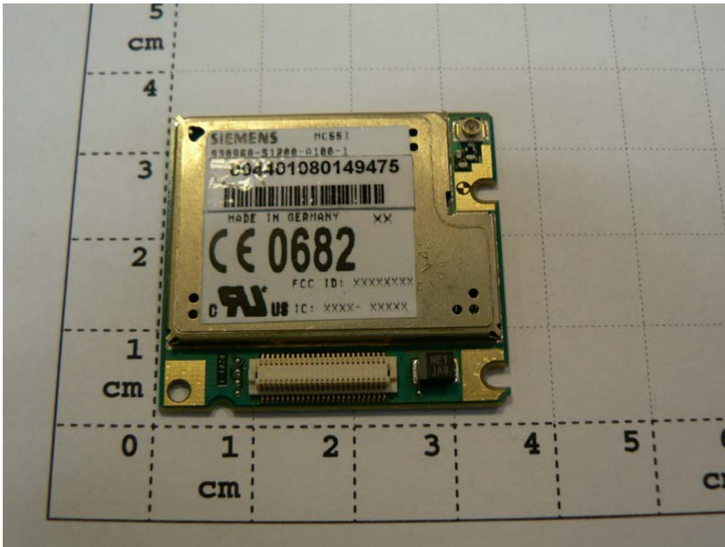
Photograph 1: Equipment under test: EUT A: Top view module