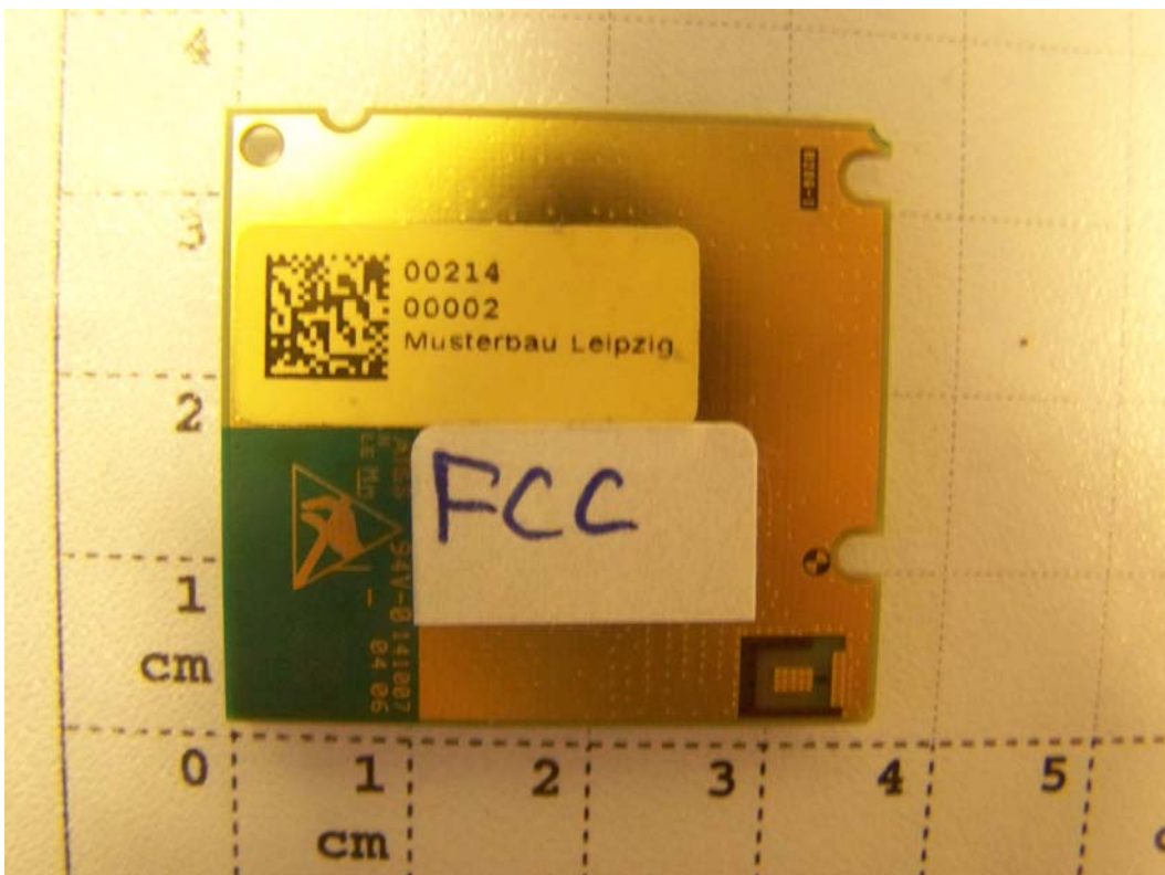
Photograph 2: Equipment under test: EUT A: Rear view module