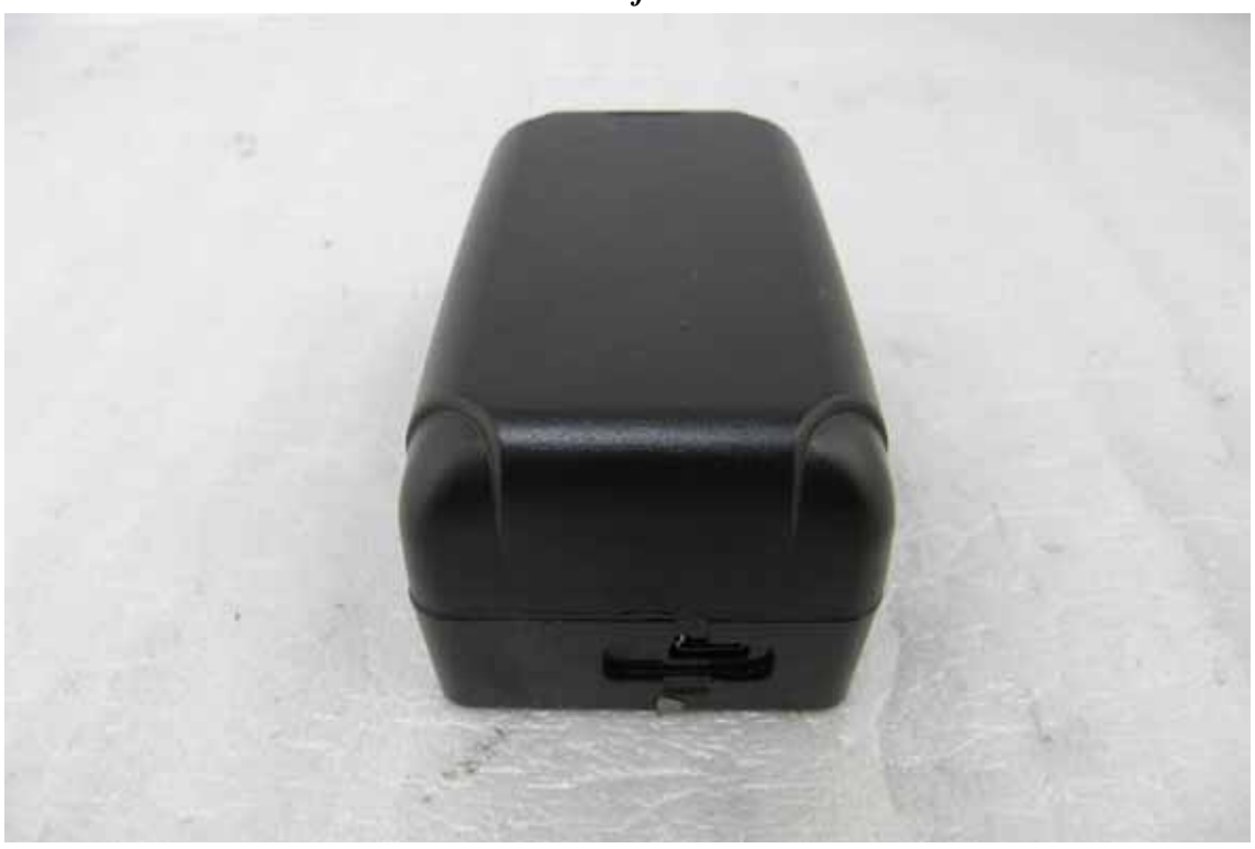
Adaptor (model: GFP051U-0510)