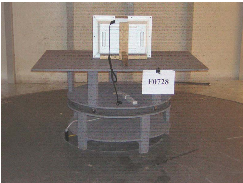
Fundamental, Harmonic and Spurious Radiated Emissions Rear