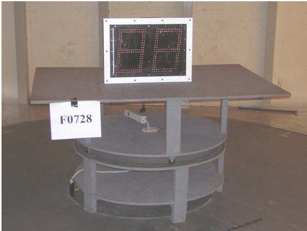
Fundamental, Harmonic and Spurious Radiated Emissions - Front