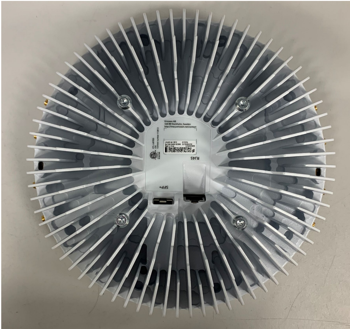
Figure 2: Dot 2266 B48B41B25B66 Bottom View