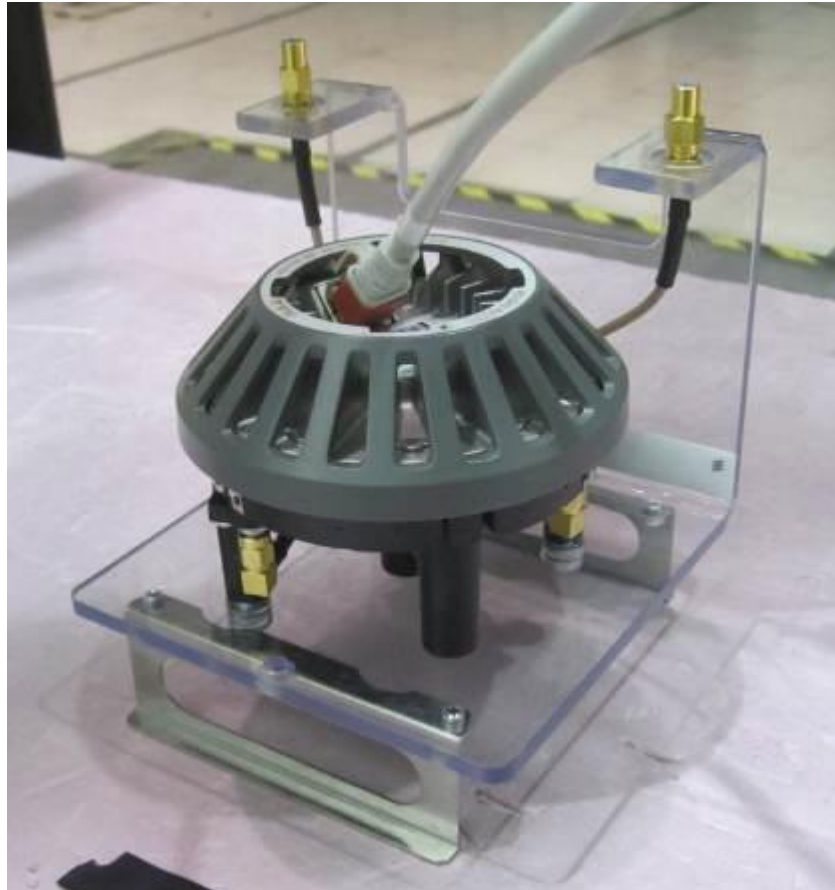
Figure 2 Radiated Emissions Test Setup (Close up)