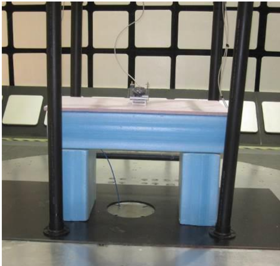
Figure 1 Radiated Emissions Test Setup