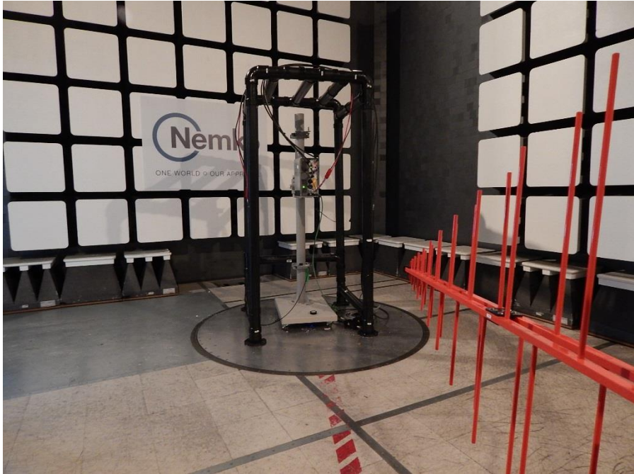
Figure 8.3-2: EUT Set -up for Radiated Compliance Testing – below 1 GHz