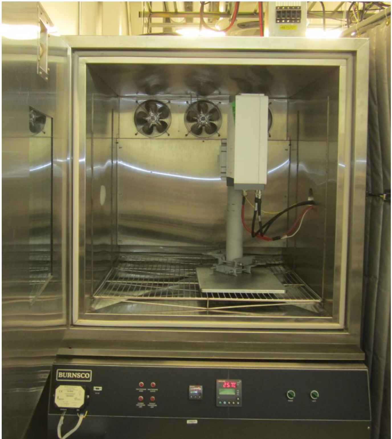
Figure 3.6-2: EUT Set-up for Radio Compliance Testing