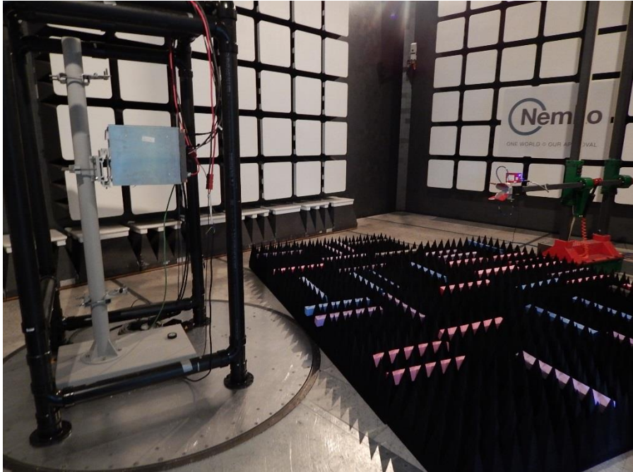
Figure 8.3-3: EUT Set -up for Radiated Compliance Testing– above 1 GHz