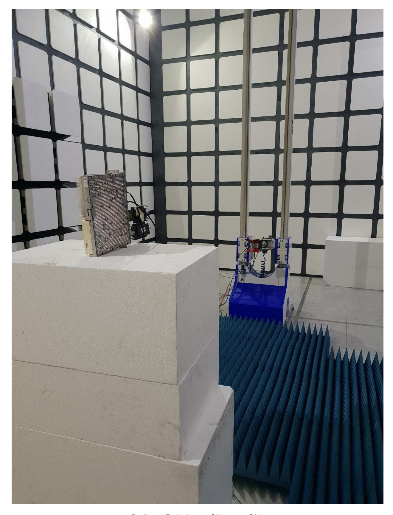
Radiated Emissions 8 GHz to 18 GHz