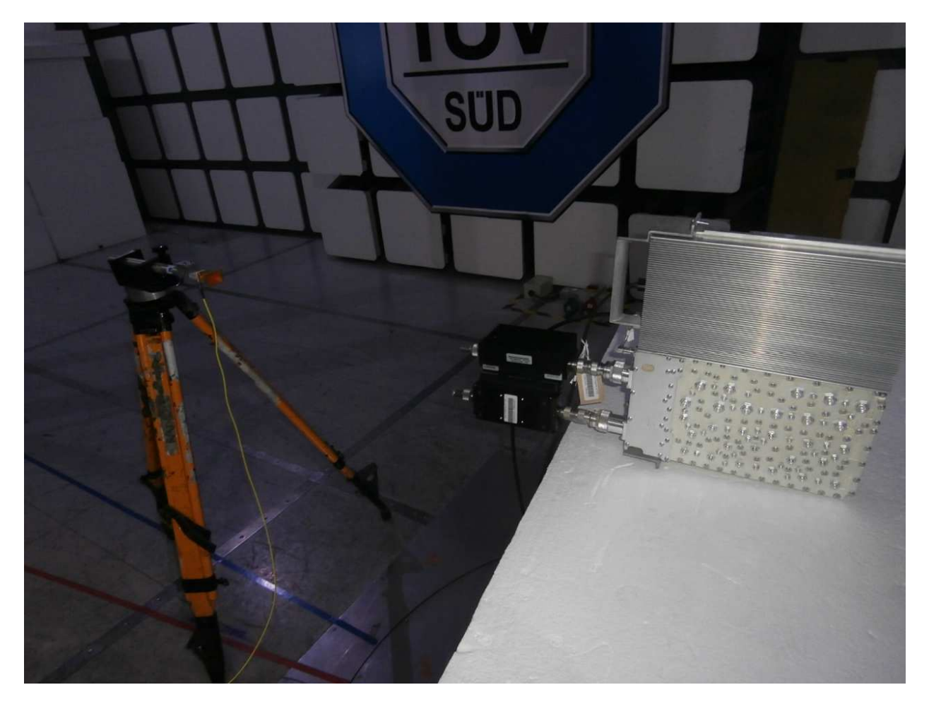
Radiated Emissions 18 GHz to 25 GHz