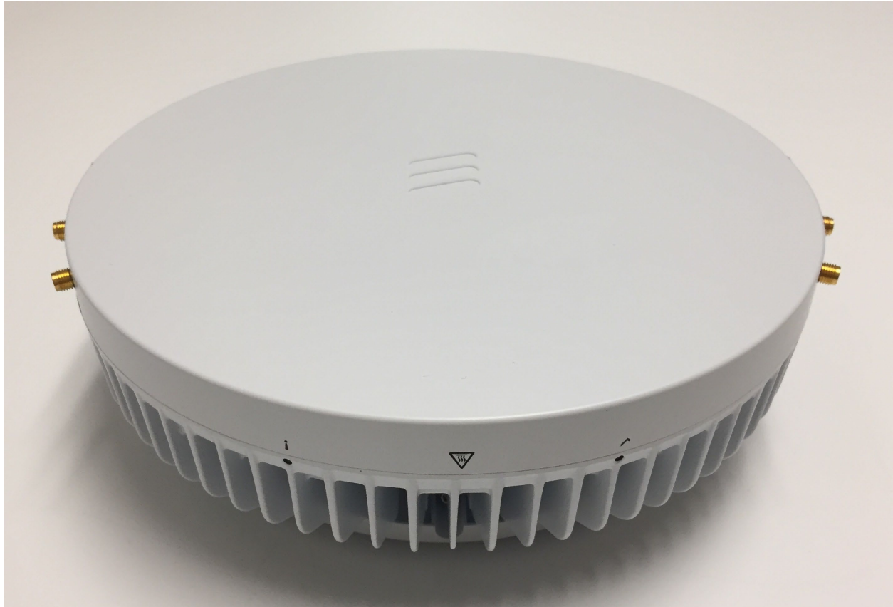
Figure 1: Dot 4465 B77DB77GB41 Top (Radome) View