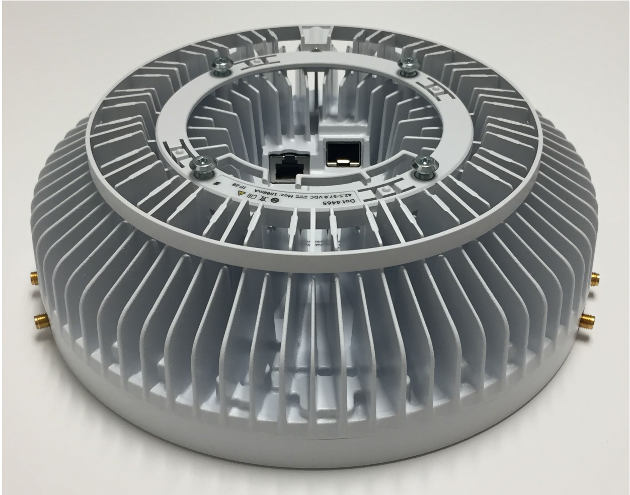
Figure 3: Dot 4465 B77DB77GB41 Side View