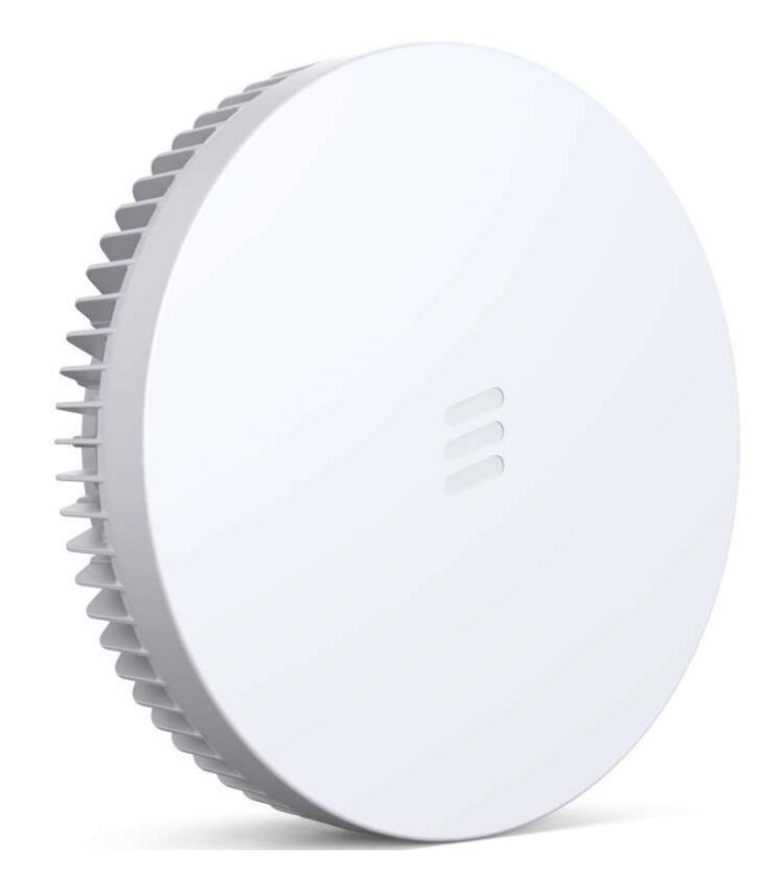
Figure C.1: View of the EUT.