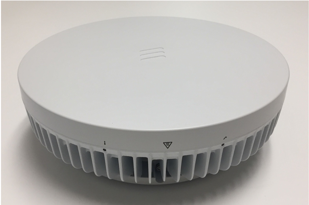
Figure 1: Dot 4455 B77DB77GB41 Top (Radome) View