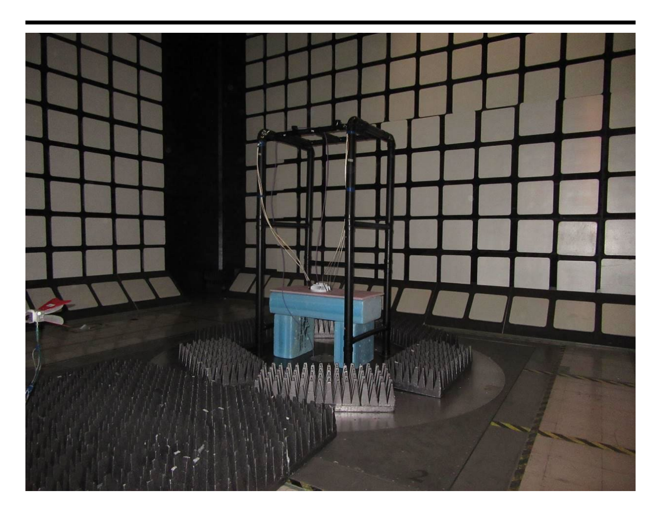
Figure 2: Radiated Test setup (frequency above 1000MHz)

FCCID: TA8AKRY901537-1 and TA8AKRY901537-2