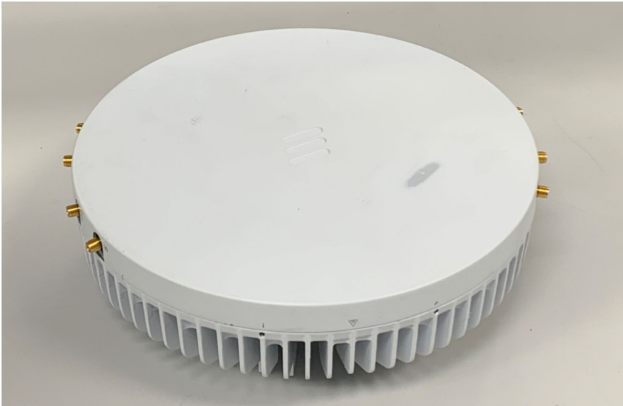
Figure 1: Dot 2266 B48B41DB25B66 Top (Radome) View