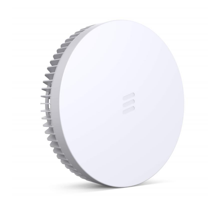
Figure C.1: View of the EUT.