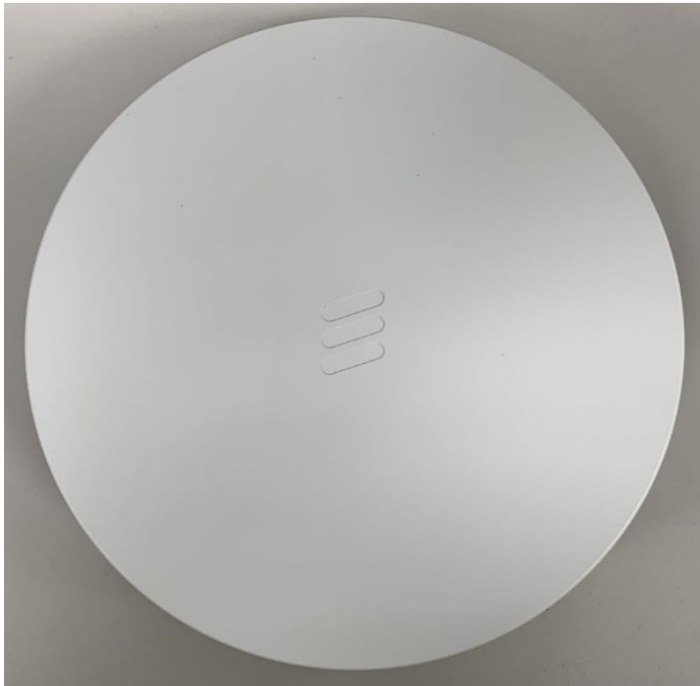
Figure 1: Dot 2256 B48B41B25B66 Top (Radome) View