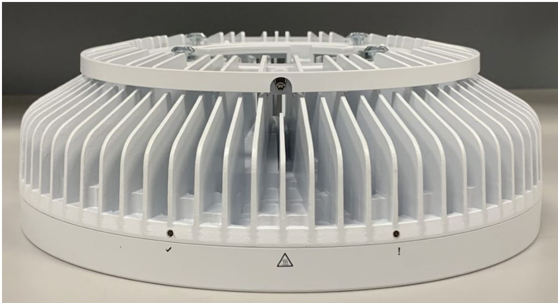
Figure 3: Dot 2256 B48B41B25B66 Side View