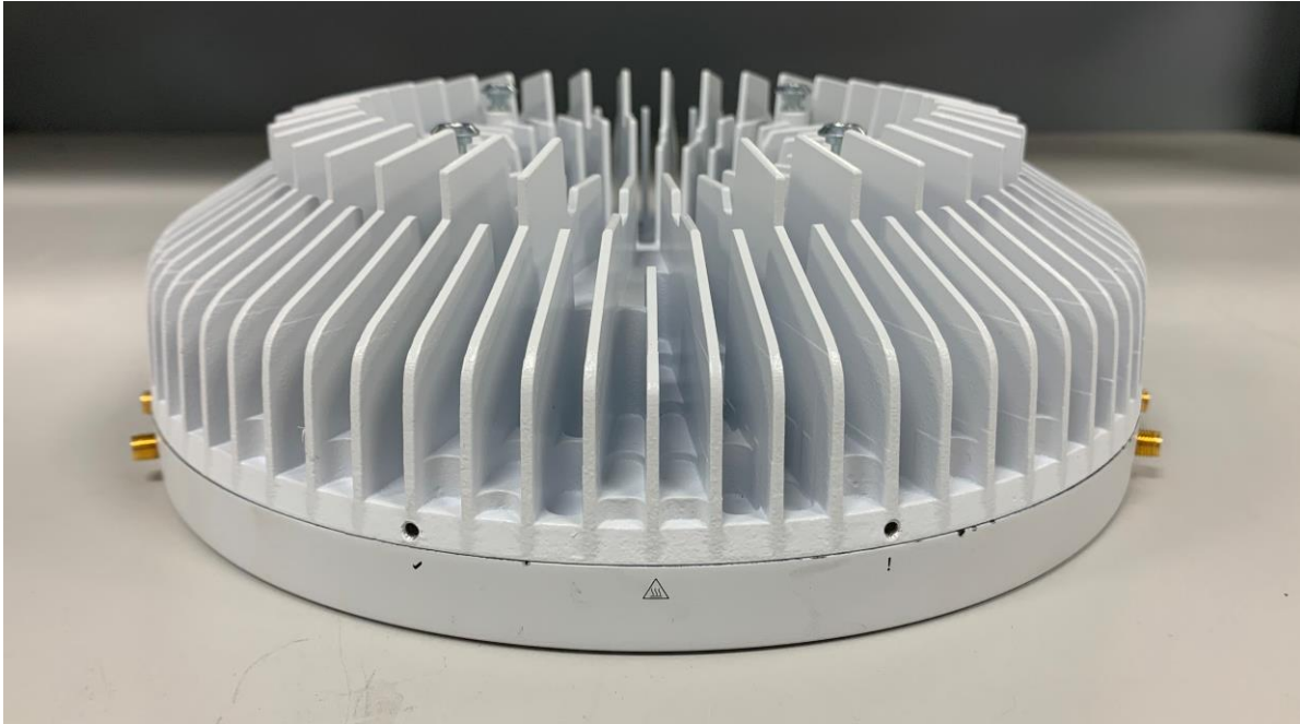
Figure 3: Dot 4465 B77DB25B66 Side View