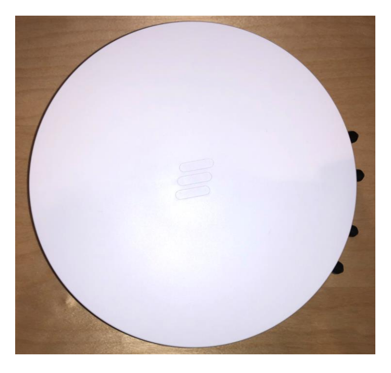
Figure 1: Dot 41Kr B48 Top (Radome) View