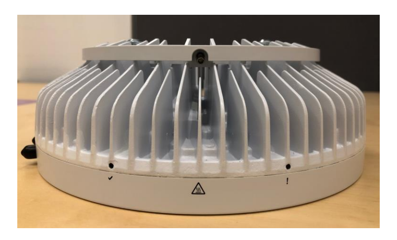
Figure 3: Dot 41Kr B48 Side View