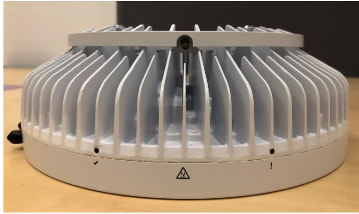
Figure 3: Dot 41Kr B77D Side View