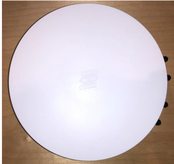
Figure 1: Dot 41Kr B77D Top (Radome) View