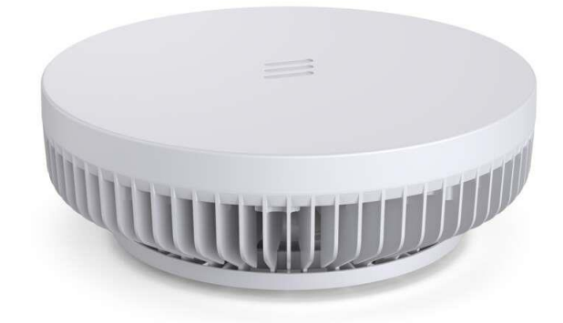
Figure C.1: View of the EUT.